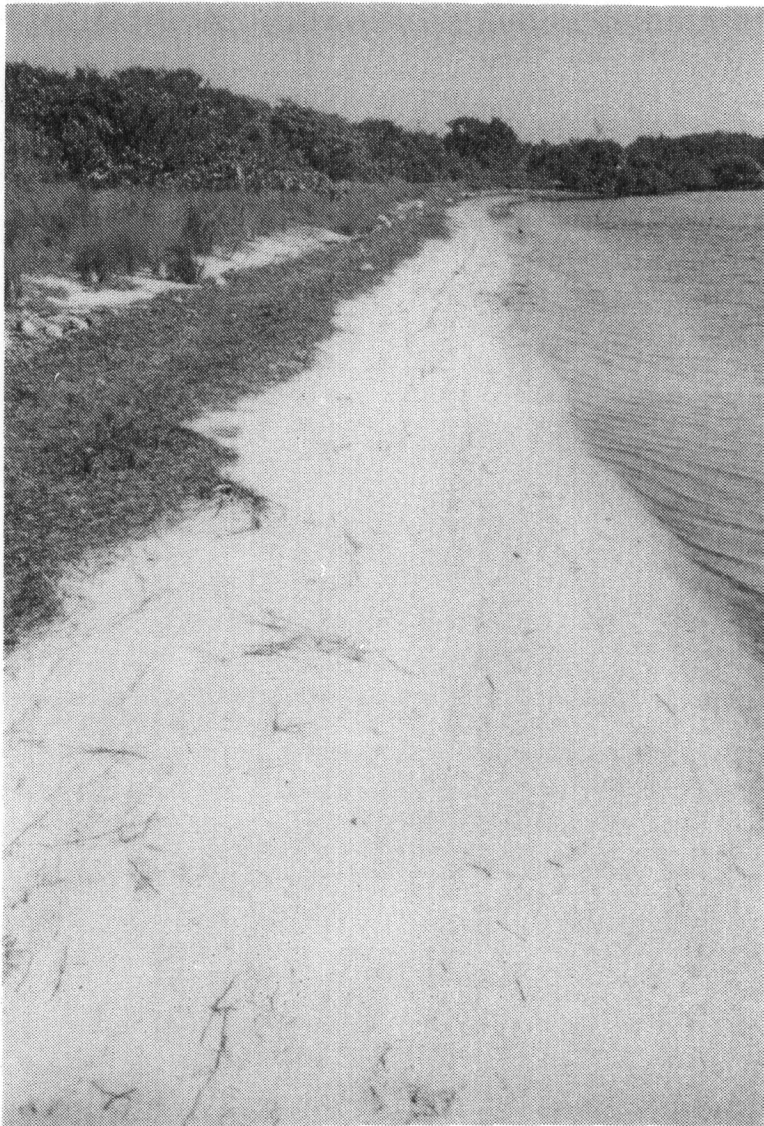
Figure 14. Long Beach, Big Pine Key