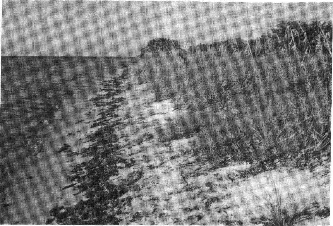
Figure 15. Sugarloaf Beach, Sugarloaf Key