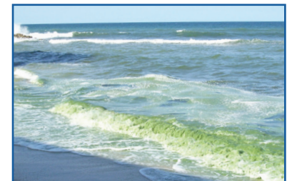
Cyanobacteria algal bloom in Martin County, summer 2016.

Although blue-green algae are found naturally, increases in nutrients can exacerbate the extent, duration and intensity of blooms. Other factors that contribute to blooms include high temperatures, reduced water flow, and lack of animals that eat algae. Although they can occur at any time, blue-green algae are most common during summer and early fall with Florida's high temperatures and abundant sunlight. The summer also brings storms that have the potential to deliver nutrients into waterways through stormwater runoff.