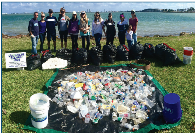
Figure 1. Marine debris removed from waterways at a Florida cleanup.

Marine debris is anything man-made and discarded that enters the marine environment. Most trash comes from land-based sources, sometimes hundreds of miles away from the coast. Trash on the ground may be swept into inland waterways by rain or wind, where it will then make its way into the ocean through rivers and streams (Figure 1).