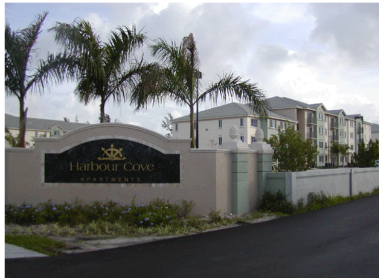
Above: Harbour Cove Apartments in Hallandale Beach.

After completing site assessment, a Monitoring Only Approval Order was issued to monitor the ammonia and petroleum-contaminated site groundwater in accordance with Chapter 62-785, Florida Administrative Code. Upon completing the prescribed monitoring to establish Alternative Groundwater Cleanup Target Levels, Harbour Cove enacted an institutional control for no groundwater use on the property. Soils contaminated with low concentrations of metals and polynuclear aromatic hydrocarbons have also been addressed through institutional and engineering controls. Redevelopment of the Harbour Cove site as a large, multi-story apartment complex has been successfully completed, and a Conditional SRCO was issued by Broward County on May 6, 2009.