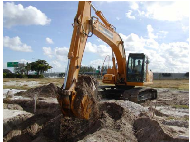
Above: Excavation of contaminated soils at the former boiler room area at McArthur Dairy

The second BSRA in Broward County was executed April 12, 2004, with South Florida Sports Committee, Inc. The property is located at 2600 SW 36th Street in Dania Beach and consists of 12 acres.