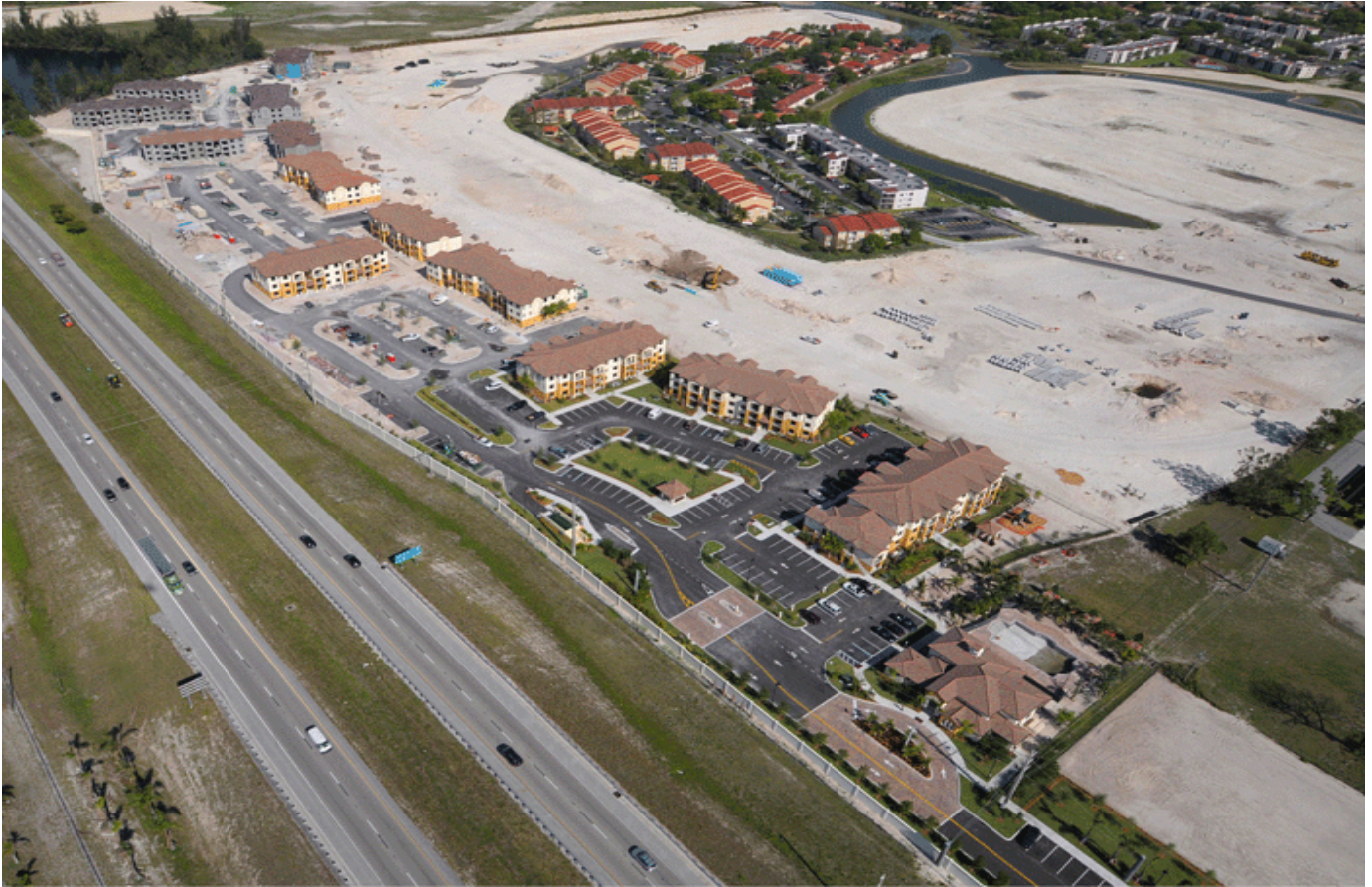
Above: Sorrento at Miramar (foreground) under construction on the ZF Brownfield Site (taken April, 2012)

The sixth BSRA in Broward County was executed December 27, 2011, with ZOM Foxcroft, LP. The property is located at 8991 SW 41 st Street in Miramar and consists of 15.16 acres. The ZF Brownfield Site is a portion of the former Foxcroft Golf Course.