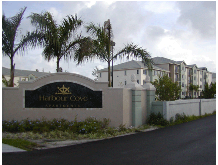
Above: Harbour Cove Apartments in Hallandale Beach.

After completing site assessment, a Monitoring Only Approval Order was issued to monitor the ammonia and petroleum-contaminated site groundwater in accordance with Chapter 62-785, Florida Administrative Code. Upon completing the prescribed monitoring to establish Alternative Groundwater Cleanup Target Levels, Harbour Cove enacted an institutional control for no groundwater use on the property. Soils contaminated with low concentrations of metals and polynuclear aromatic hydrocarbons have also been addressed through institutional and engineering controls. Redevelopment of the Harbour Cove site as a large, multi-story apartment complex has been successfully completed, and a Conditional SRCO was issued by Broward County on May 6, 2009.