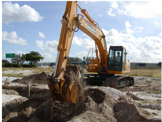
Above: Excavation of contaminated soils at the former boiler room area at McArthur Dairy