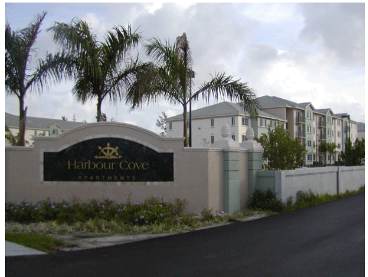
Above: Harbour Cove Apartments in Hallandale Beach.

After completing site assessment, a Monitoring Only Approval Order was issued to monitor the ammonia and petroleum-contaminated site groundwater in accordance with Chapter 62-785, Florida Administrative Code. Upon completing the prescribed monitoring to establish Alternative Groundwater Cleanup Target Levels, Harbour Cove enacted an institutional control for no groundwater use on the property. Soils contaminated with low concentrations of arsenic and polynuclear aromatic hydrocarbons have also been addressed through institutional and engineering controls. A Conditional SRCO was issued by Broward County on May 6, 2009.