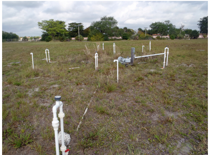
Above: Bio-sparge remediation system at the McArthur Dairy Brownfield Site