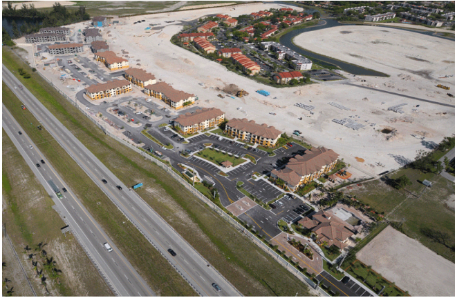
Above: Sorrento at Miramar (foreground) under construction on the ZF Brownfield Site (taken April 2012)

The sixth BSRA in Broward County was executed December 27, 2011, with ZOM Foxcroft, LP. The property is located at 8991 SW 41 st Street in Miramar and consists of 15.16 acres. The ZF Brownfield Site is a portion of the former Foxcroft Golf Course.