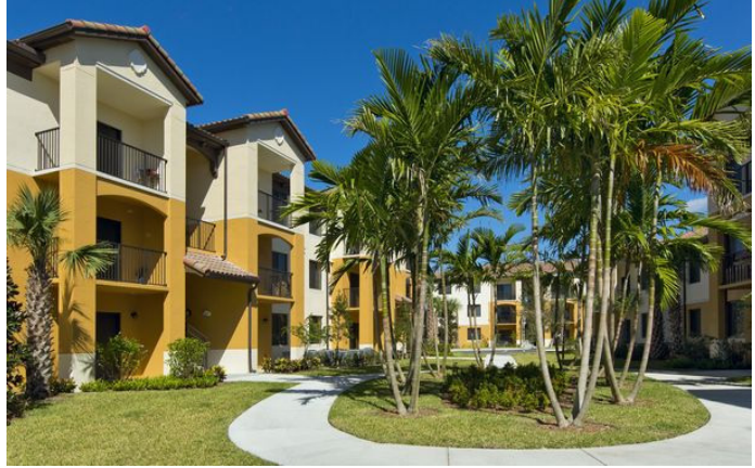
Above: Common space at Sorrento at Miramar as completed (taken November 2012)

Prior to execution of the BSRA, site assessment had been conducted on the entire former Foxcroft Golf Course to determine the magnitude and extent of arsenic contamination in soil and groundwater pursuant to Chapter 62-780, Florida Administrative Code. The arsenic contamination stemmed from the application of herbicides on the former golf course. Groundwater contamination throughout the golf course was monitored for a period of one (1) year, and Broward County also approved a soil management strategy as a Remedial Action Plan. Site soils now meet Residential Direct Exposure Cleanup Target Levels, and a Declaration of Restrictive Covenant was recorded to restrict groundwater use. The ZF Brownfield site has been successfully redeveloped as Sorrento at Miramar, a multi-story apartment complex. The grand opening was held on July 26, 2012, and the unit lease rate is currently 100% with a waiting list. A site plan, more pictures, and a community brochure can be found online at http://www.zrsapartments.com/Sorrento/miramar-fl-apartments.asp .