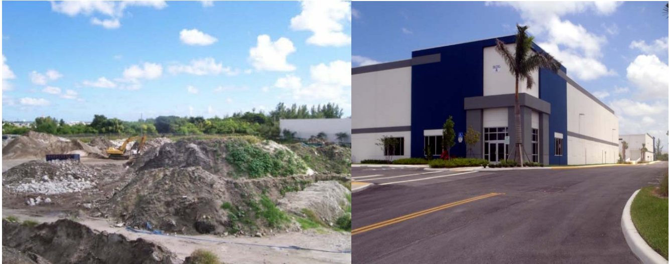
Above: The Dania Motocross Site in 2010 (left) and after rehabilitation and redevelopment in 2015 (right)

After conducting supplemental groundwater assessment, South Florida Sports Committee submitted a certified No Further Action with Conditions (NFAC) proposal to Broward County. Broward County approved the NFAC proposal on October 14, 2004, which established Alternative Groundwater Cleanup Target Levels and implemented a deed restriction prohibiting future groundwater use. A Conditional Site Rehabilitation Completion Order (SRCO) was issued by Broward County on August 1, 2006. During 2014, the site was redeveloped into a warehouse complex.