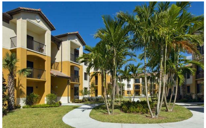
Above: Common space at Sorrento at Miramar as completed (taken November 2012)

Site soils now meet Residential Direct Exposure Cleanup Target Levels, and a Declaration of Restrictive Covenant was recorded to restrict groundwater use. The ZF Brownfield site has been successfully redeveloped as Sorrento at Miramar, a multi-story apartment complex. The grand opening was held on July 26, 2012, and the unit lease rate is currently 100% with a waiting list. A site plan, more pictures, and a community brochure can be found online at http://www.zrsapartments.com/Sorrento/miramar-fl-apartments.asp .