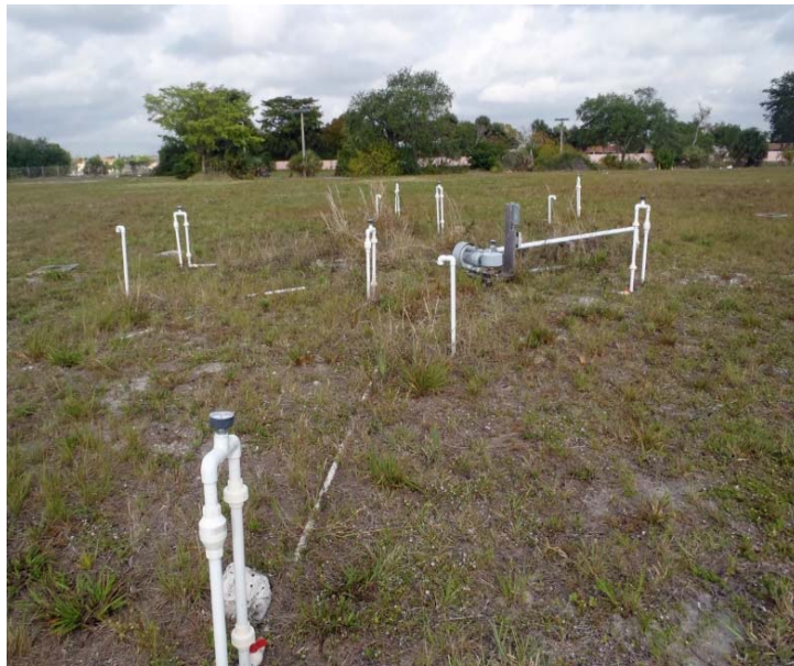
Above: Bio-sparge remediation system at the McArthur Dairy Brownfield Site

The McArthur Dairy has or has had contamination resulting from two (2) petroleum and one (1) chlorinated solvent discharge; one of the petroleum contaminant plumes was eligible for future state funding in the Petroleum Cleanup Program. The property is currently a vacant lot which is fenced off from public access. The property was purchased by Cricket Club Lauderdale, LLC, in March 2015, with the purpose of redeveloping the site into a multi-family unit residential complex. A brief summary of rehabilitation activities conducted during the 2014 reporting period for each of the contaminant areas is as follows: