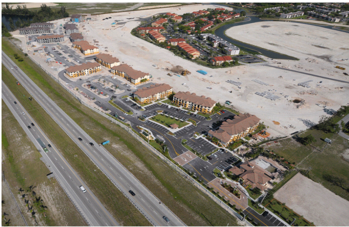
Above: Sorrento at Miramar (foreground) under construction on the ZF Brownfield Site (taken April 2012)

Prior to execution of the BSRA, site assessment had been conducted on the entire former Foxcroft Golf Course to determine the magnitude and extent of arsenic contamination in soil and groundwater pursuant to Chapter 62-780, Florida Administrative Code. The arsenic contamination stemmed from the application of herbicides on the former golf course. Groundwater contamination throughout the golf course was monitored for a period of one (1) year, and Broward County also approved a soil management strategy as a Remedial Action Plan.