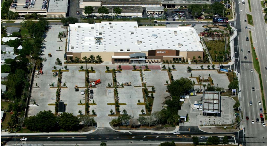
The Wal-Mart Neighborhood Market in Pompano Beach

Polynuclear aromatic hydrocarbon (PAH) and arsenic contamination was identified in site soils and groundwater. After completing soil removal efforts in 2013, the site groundwater is being monitored; ultimately a Declaration of Restrictive Covenant will be executed to address any remaining contamination so that a Conditional SRCO may be issued.