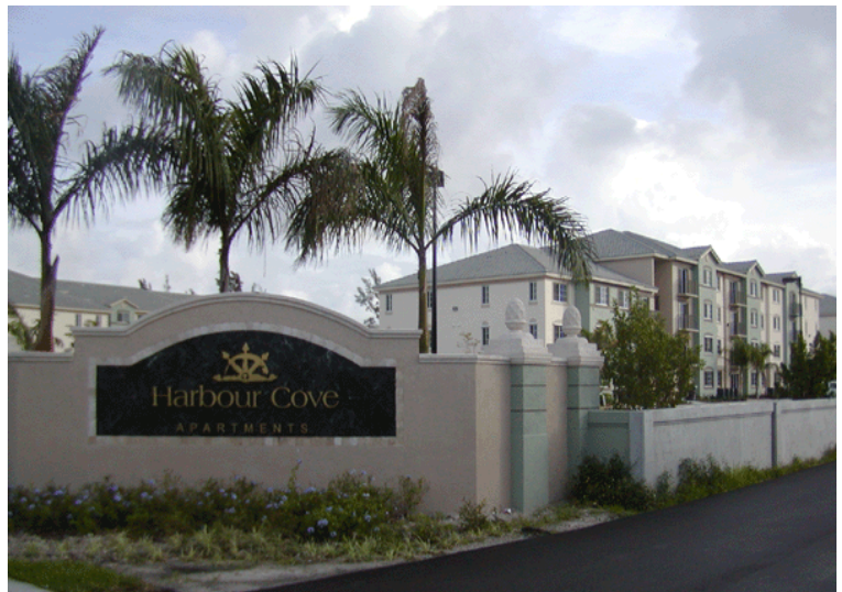
Above: Harbour Cove Apartments in Hallandale Beach.

After completing site assessment, a Monitoring Only Approval Order was issued to monitor the ammonia and petroleum-contaminated site groundwater in accordance with Chapter 62-785, Florida Administrative Code. Upon completing the prescribed monitoring to establish Alternative Groundwater Cleanup Target Levels, Harbour Cove enacted an institutional control for no groundwater use on the property. Soils contaminated with low concentrations of