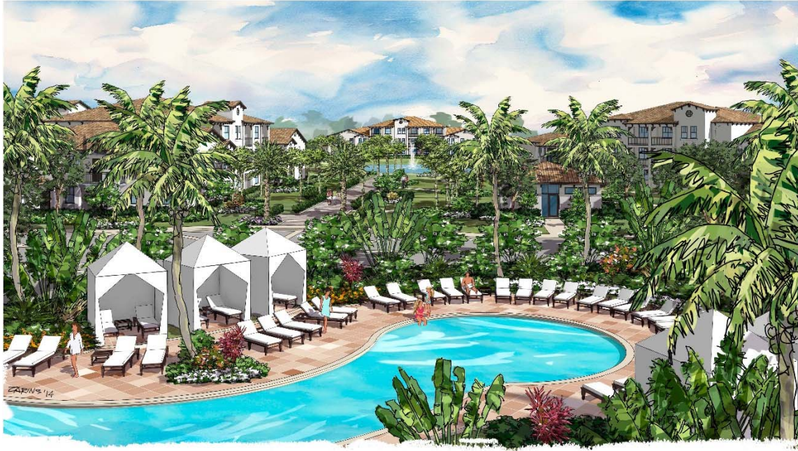
Above: Artist's rendering of the finished West Atlantic Boulevard Apartment site in Pompano Beach

The BSRA for the West Atlantic Boulevard Apartment Investors site in Pompano Beach was executed December 18, 2015, with West Atlantic Boulevard Apartment Investors, LLC. The site (also known as Residences at Palm Aire) is generally located at the northeast corner of the Turnpike and Atlantic Boulevard in Pompano Beach and was purchased by West Atlantic Boulevard Apartment Investors, LLC, in 2015. The site is also known as Phase 1 of the overall former Palm Aire Golf Course redevelopment project.