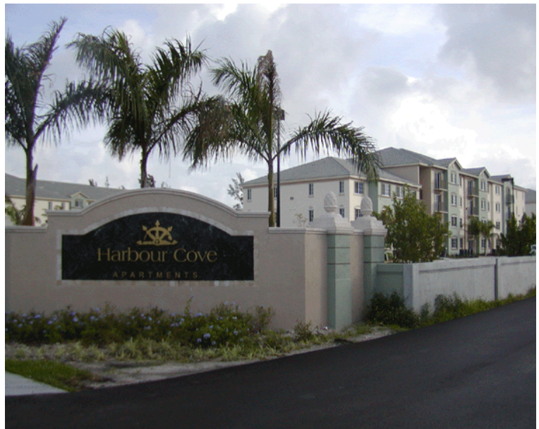
Above: Harbour Cove Apartments in Hallandale Beach.

After completing site assessment, a Monitoring Only Approval Order was issued to monitor the ammonia and petroleum-contaminated site groundwater in accordance with Chapter 62-785, Florida Administrative Code. Upon completing the prescribed monitoring to establish Alternative Groundwater Cleanup Target Levels, Harbour Cove enacted an institutional control for no groundwater use on the property. Soils contaminated with low concentrations of