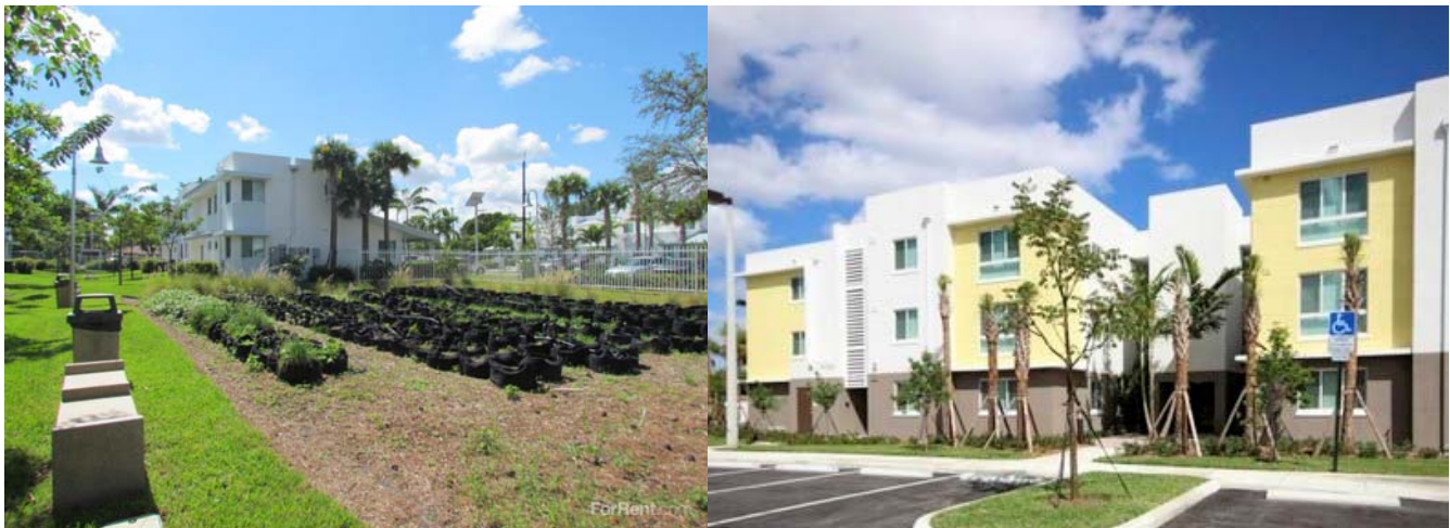
Above: Urban gardens and similar construction to the Northwest Gardens V Site in Fort Lauderdale

As a result of the Brownfield Area designation and the executed BSRA, the development partners were able to move forward with construction confidently, breaking ground on 100 new units and 100 renovated units in February 2016. Foundations have already been poured in four of the six new buildings. With major financial assistance from a sales tax refund on construction materials available to residential developers that provide affordable housing, construction is expected to conclude in December 2016, well ahead of schedule. The first residents are expected to move in prior to February 2017, and full occupancy is expected sometime in the second quarter of 2017. The project will offer a number of community-enhancing and capacity building amenities, including a fully furnished clubhouse, a computer lab, library, urban gardens, and a bocce ball court.