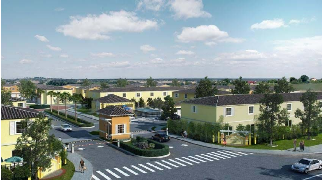
Above: Artist rendering of the Cricket Club (Courtesy: DRHorton)

MAS Development began site grading and earth-moving work in March 2017 and is going to build 155 townhomes. To be known as Cricket Club, the three-bedroom homes will have about 1,320 square feet of living space; prices will start in the mid-$200,000s. The community will have a clubhouse, playground, pool, and greenspace.