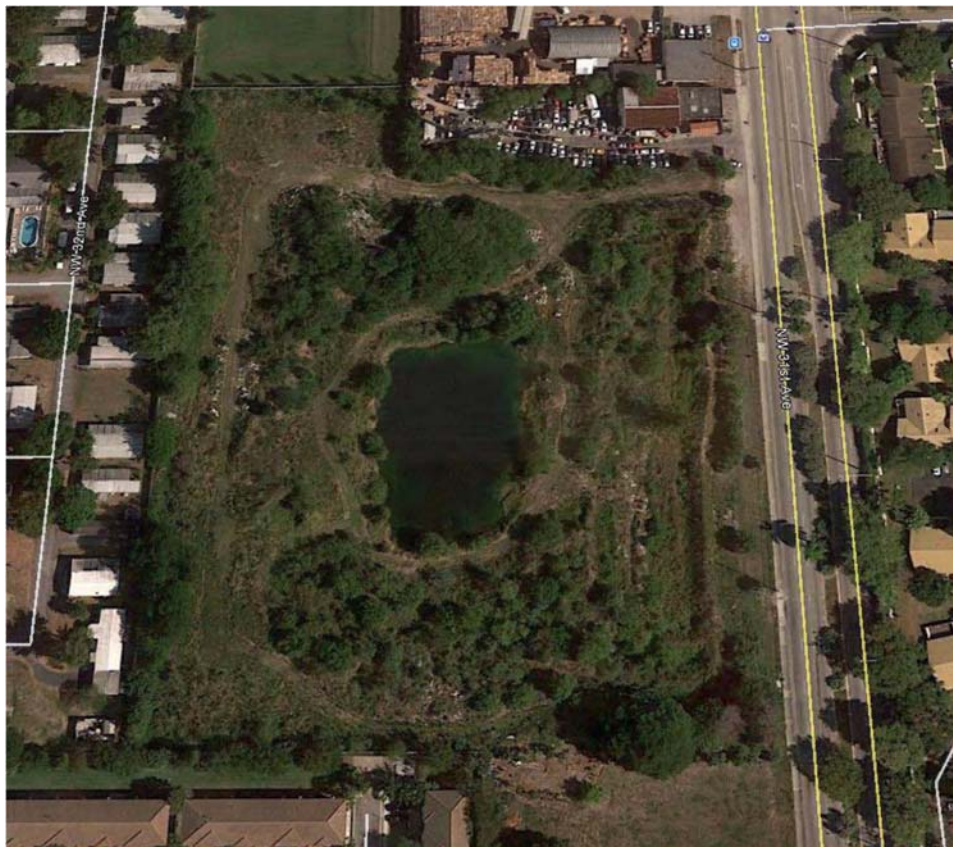
Above: The Oakland Parcel Green Reuse Site in Oakland Park

throughout the site, and Total Recoverable Petroleum Hydrocarbons were identified in soils within a small area near the center of the property. On May 16, 2017, Broward County approved a Remedial Action Plan that includes limited source removal of impacted soils, the application of two (2) feet of clean fill throughout the property as an engineering control, and monitoring of site groundwater to ultimately implement institutional and engineering controls through a Declaration of Restrictive Covenant. Remediation activities are to begin in the third quarter of calendar year 2017.