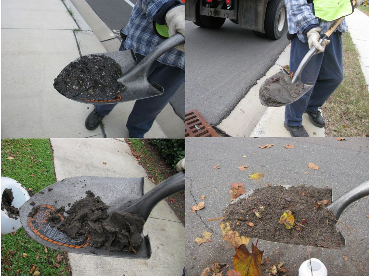
Figure 1: Visual indication of moisture content variability that can be observed in collected samples of solids that have been recovered during the MS4 study (can vary from dry to wet (top left))