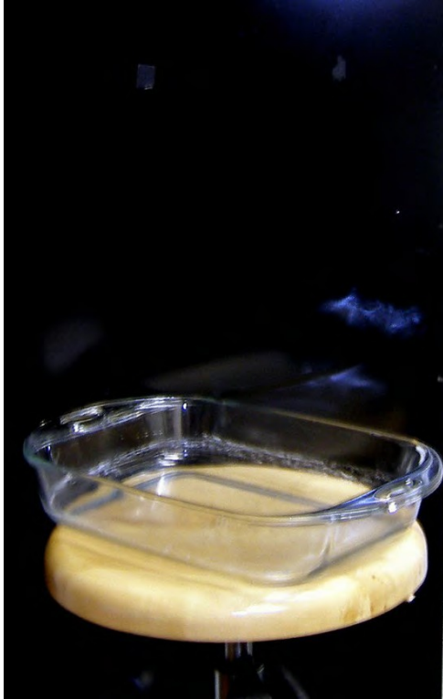
Figure 3: Pyrex baking dish for drying collected sample (clean and dry before pouring in sample)