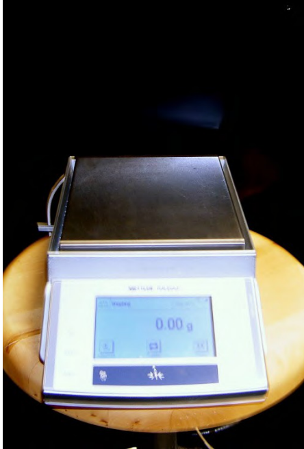
Figure 5: Top-loading weighing scale ('zero' scale before using)