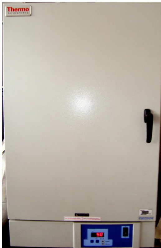
Figure 2: Oven set to 50 to 60 degrees C for drying out the collected sample placed in Pyrex dishes