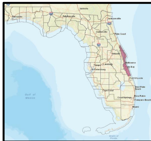
Area impacted by HB 1379 requirements for all lot sizes starting January 1, 2024 (also subject to requirements to upgrade existing systems by January 1, 2030).