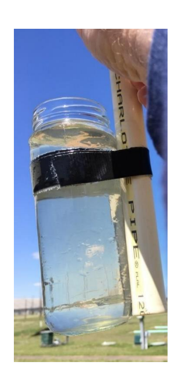
Mature Biofilm → On the pods producing clear, odorless effluent

BioMaze<sup>™</sup> Porous Fine Air Diffuser Stones - ASSEMBLY