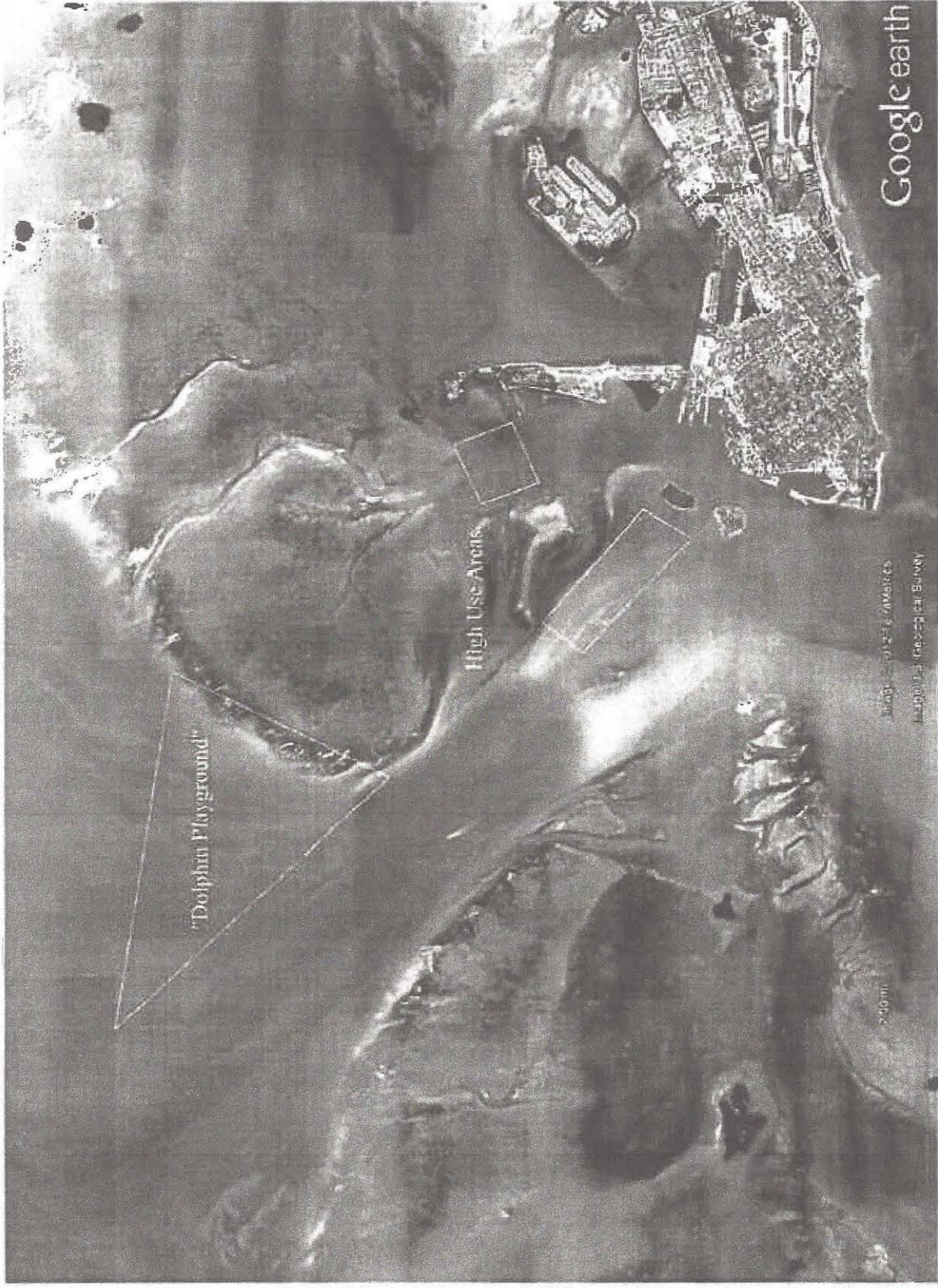
Google Earth Pro miles 5 km 9 ▲