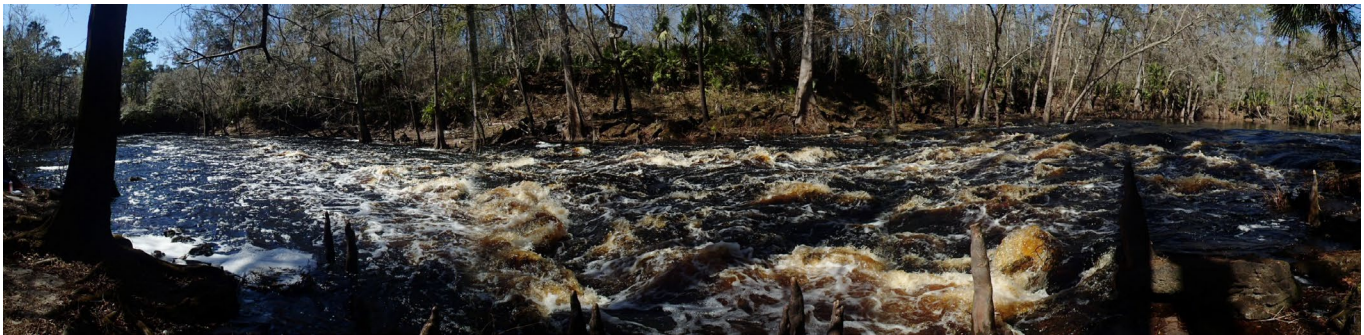
Aucilla Rapids, photos Liz Sparks

Lumbermen removed most of the old-growth cypress from the swamps early in the 20th century. They constructed raised roadbeds (trams) for locomotives to haul huge timbers out of the swamps. Stands of native longleaf pine were replanted with fast-growing slash and loblolly pines for pulpwood. Today, some of these trams still provide roadways for vehicles, while others are smaller pathways for hikers, cyclists and wildlife.