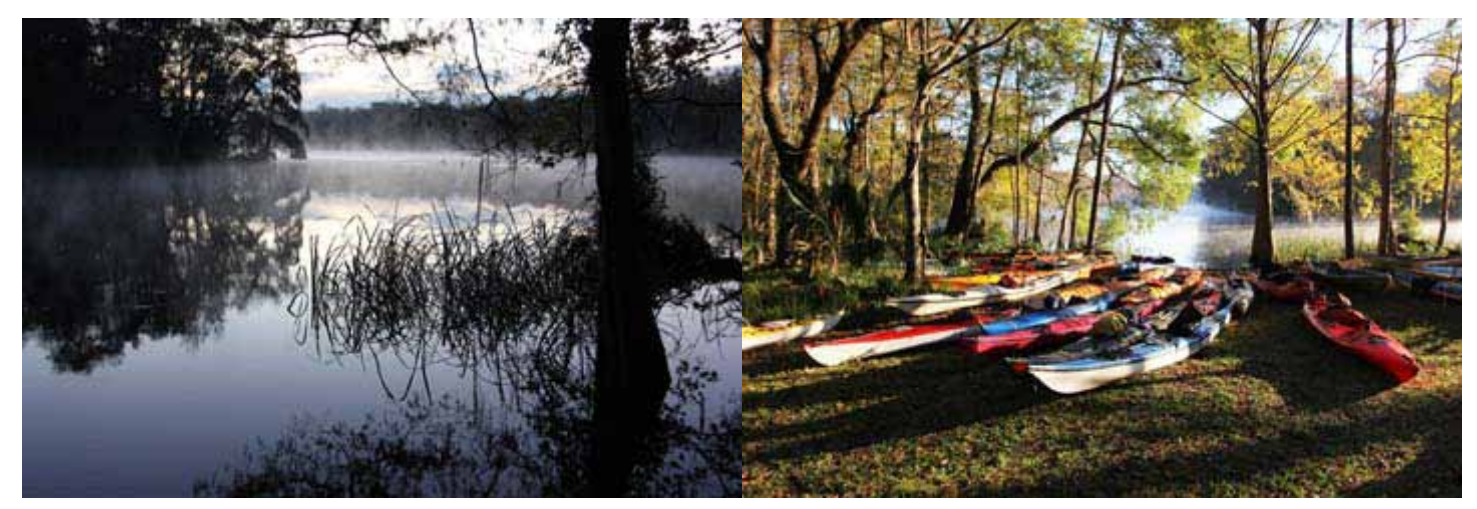
Dawn mists and kayaks at Dunn's Creek State Park.

Lower Store with the most poignant concerning the effect on some Seminoles who had been given 20 kegs of rum. "They were soon prevailed on to broach their beloved nectar; which in the end caused some disturbance, and the consumption of most of their liquor; for after they had once got a smack of it, they never were sober for ten days, and by that time there was but little left."