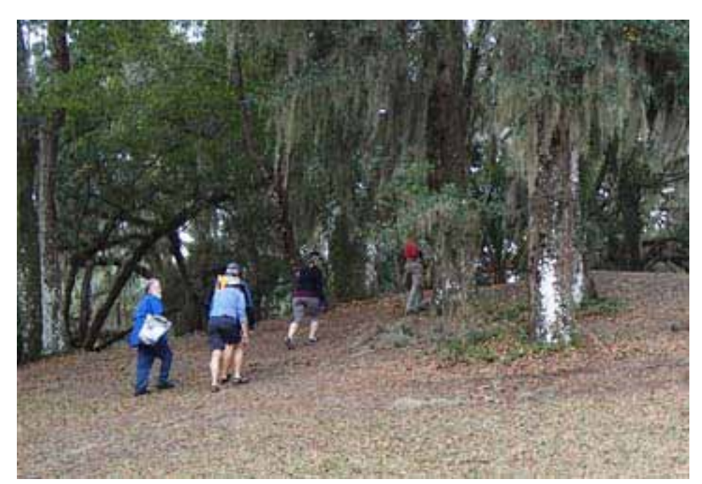
The group climbing Mount Royal, an ancient Indian temple mound.