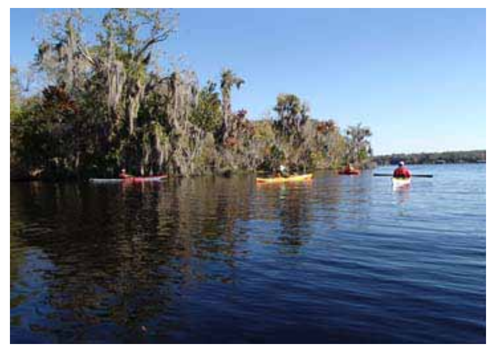
Group paddling past Buzzard's Island on last day.

At Georgia Boys Fish Camp on Dunn's Creek, one of the oldest in the state, a couple of hundred humorous hand-made signs hung from the rafters and were nailed to posts and walls. Some words of wisdom were worth repeating: "No wife has shot her husband while he was washing dishes." An-