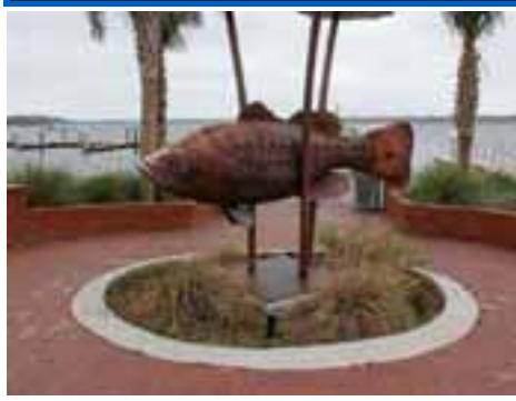
Riverside park in Palatka with bass statue.

C/O JASON DESIGN 7 JEFFREY LANE, BRANFORD, CT 06405 WWW.OUTER-ISLAND.COM