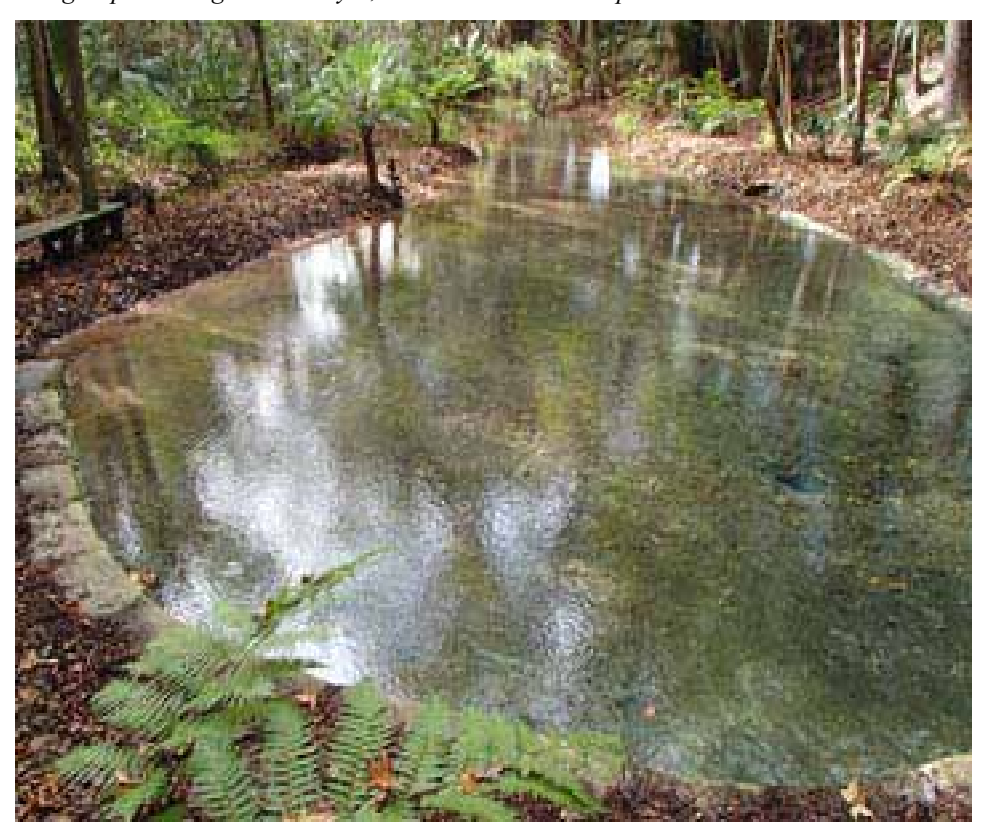
The magical Satsuma Springs was why many of us came on the trip.

the headwinds the next morning, but a few had to be assisted by a Sheriff's safety boat. We took welcome breaks to view important Bartram historic sites. The first was Mount Royal, an ancient Indian temple mound described by Bartram as one that could