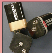
Large lantern batteries are also alkaline batteries.

The added hazardous component of alkaline batteries, mercury was eliminated in the 1990s. Since then, waste characterization studies have shown that nearly all of the old mercury alkaline batteries have already been disposed of. Nearly all of the alkaline batteries in use in Florida today have no added hazardous components. Under state law and regulations, alkaline batteries can be disposed of in the trash.