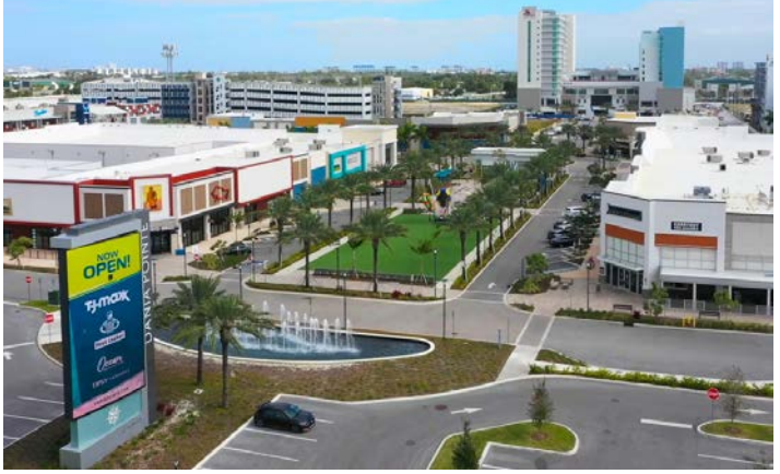
Page 15 of 38

Top: aerial view of the Dania Pointe Brownfield Site under redevelopment in April 2019 Below: picture of the entrance of the finished Dania Pointe development