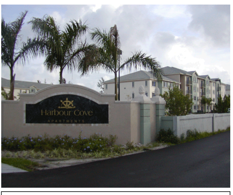
Above: Harbour Cove Apartments in Hallandale Beach.

Redevelopment has been completed, and the site now consists of four (4) multi-family, multistory apartment buildings housing 212 units.