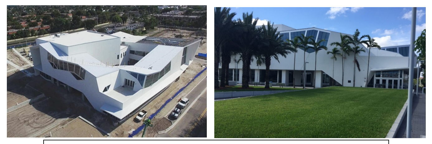
Above left and right: The Library and Civic Campus under construction and completed.

The sites and surrounding area were redeveloped as a 46,000 square-foot Library and Cultural Center adjacent to Pompano Beach City Hall. The design includes a live dance and theater space, a digital media center, an art gallery, and a new public plaza north of the building forming an exterior gathering space. The civic plaza features raised planter areas, street furniture, and a new paved breezeway connected to parking areas. For more information, see <a href="https://ccpompano.org//who-we-are/">https://ccpompano.org//who-we-are/</a>