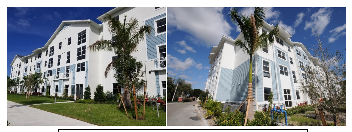
Above (left and right): the completed Saratoga Crossings Development

Contamination at the site consists of arsenic in soils and groundwater that is likely tied to the property's historical agricultural usage. On February 22, 2019, Broward County approved a Remedial Action Plan that included plans to excavate areas of arsenic-contaminated soil for reuse onsite to raise the elevation of building pads constructed for the apartment buildings. Remaining contaminated soils and groundwater will be addressed through engineering and institutional controls instituted by a recorded Declaration of Restrictive Covenant in pursuit of a Conditional Site Rehabilitation Completion Order. To date, redevelopment is complete with 100% of the units occupied. Through the VCTC Program, $33,915 in corporate income tax credit has been awarded to offset the costs of rehabilitation.