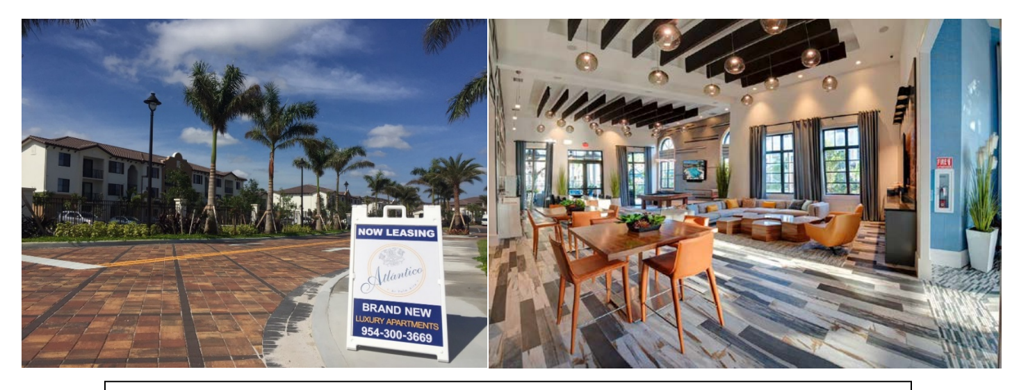
Above: Atlantico at Palm Aire

The City of Pompano Beach approved and permitted a 210-unit rental community for the site called Atlantico at Palm Aire, with a total capital cost estimated at $34 million. The development consists of nine (9) new threestory multi-family buildings, a club house, tot lot, dog park, and a bike path. As of the date of this Report, site rehabilitation and construction of the complex are complete. A Declaration of Restrictive Covenant has been recorded to enact a groundwater use restriction and maintenance of engineering controls, and a Conditional Site Rehabilitation Completion Order was issued on September 20, 2018. Through the VCTC Program, FCI Development Ten LLC, received over $785,000 in corporate income tax credits for assessment and cleanup work.