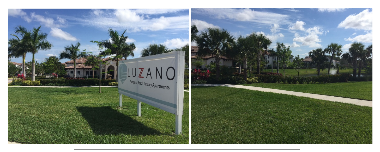
Above: Luzano, the completed 414-unit luxury apartment complex.

The BSRA for the West Atlantic Boulevard Apartment Investors site in Pompano Beach was executed December 18, 2015, with West Atlantic Boulevard Apartment Investors, LLC. The site (also known as Residences at Palm Aire) is generally located at the northeast corner of the Turnpike and Atlantic Boulevard in Pompano Beach and was purchased by West Atlantic Boulevard Apartment Investors, LLC, in 2015. The site is also known as Phase 1 of the overall former Palm Aire Golf Course redevelopment project, and was formerly a sizeable golf course impacted with arsenic contamination from the use of herbicides.