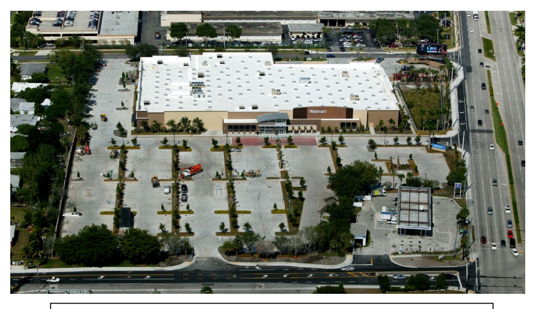
Above: The Wal-Mart Neighborhood Market in Pompano Beach

Polynuclear aromatic hydrocarbon and arsenic contamination was identified in site soils and groundwater. After completing soil removal efforts in 2013, the site groundwater was monitored and a No Further Action with Controls Proposal was approved on August 10, 2016. A Declaration of Restrictive Covenant was recorded on February 27, 2018, stipulating a restriction on groundwater use and a restriction to limit land use to commercial and industrial purposes. A Conditional SRCO was issued on October 8, 2018.