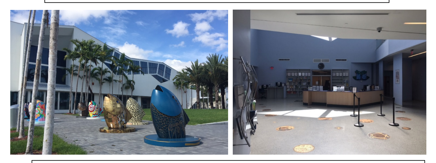
Above left and right: The completed Civic Plaza and the completed interior of the library lobby