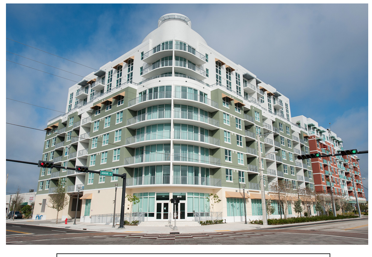
Above: Wisdom Village Crossing

Originally a warehouse and storage yard, arsenic was identified in site soils and groundwater above applicable cleanup target levels. After conducting a source removal of the impacted soils and performing over a year of groundwater monitoring, a No Further Action with Controls Proposal has been approved, and a Declaration of Restrictive Covenant was drafted to enact groundwater use restrictions on the property. A Conditional Site Rehabilitation Completion Order was issued on November 26, 2019. Through the VCTC Program, $68,254 in corporate tax income credit associated with site cleanup work has been granted.