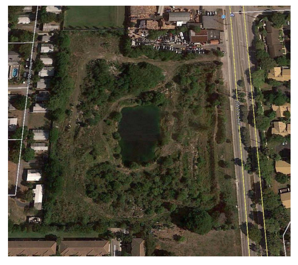
Above: The Oakland Parcel Green Reuse Site in Oakland Park

On December 14, 2016, Oakland Parcel, LLC, executed a BSRA for the Oakland Parcel Green Reuse Site. The site consists of 9.8 acres and is located at 3501 and 3551 NW 31<sup>st</sup> Avenue in Oakland Park.