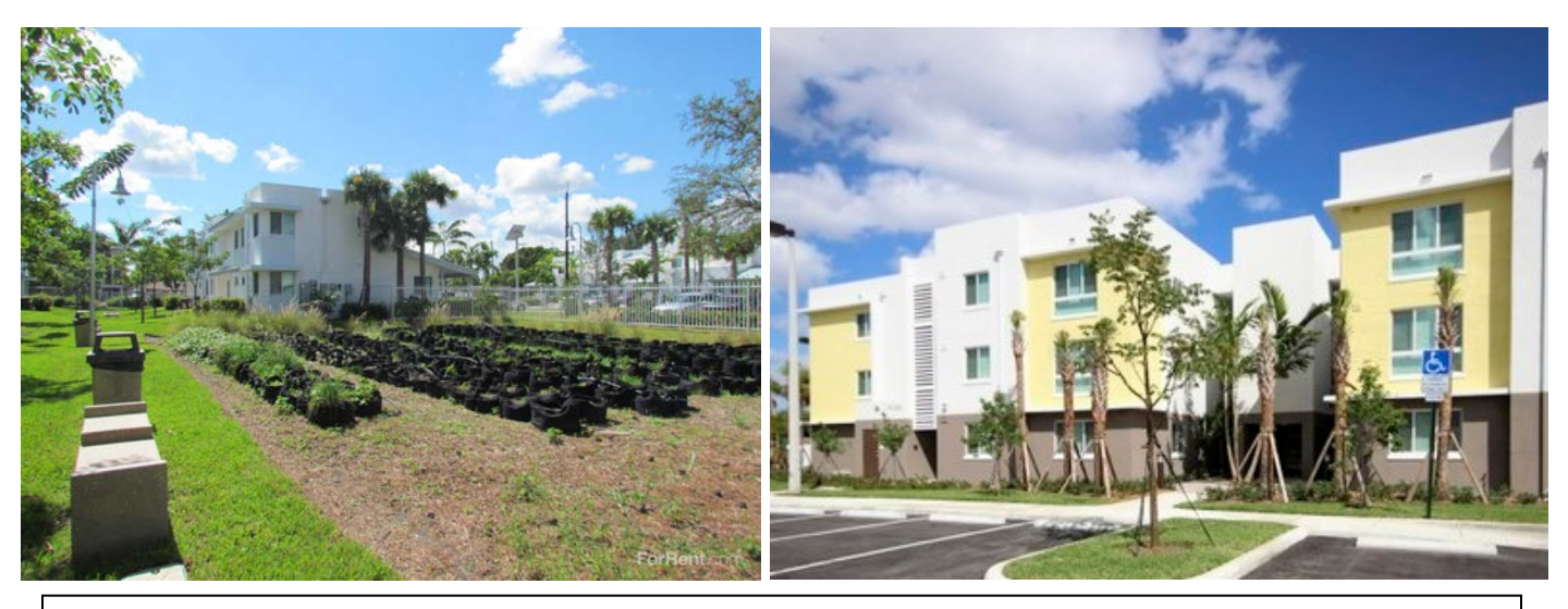
Above: Urban gardens and similar construction to the Northwest Gardens V Site in Fort Lauderdale

The contamination identified on the site consists of arsenic and polynuclear aromatic hydrocarbons in soil at concentrations greater than applicable FDEP Direct Exposure Soil Cleanup Target Levels within (and limited to) the top two-foot interval below land surface. After completing the proper removal and closure of an abandoned Underground Storage Tank, source removal of contaminated soils, and groundwater monitoring, a No Further Action with Controls was approved on December 4, 2017. A Declaration of Restrictive Covenant was drafted to place engineering controls over portions of the site and a Conditional Site Rehabilitation Completion Order was issued on February 14, 2020. Through the VCTC Program, $33,465 in corporate tax income credit has been granted in association with cleanup work.