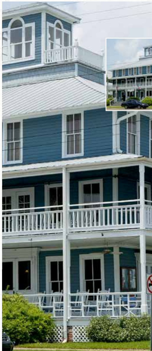
Architectural screening approaches for elevated structures may take the form of open or enclosed panels of various sizes such as the lattice-work shown on the historic Gibson Inn. The panels can be designed to cover the foundation areas. Small panel treatments may include new lattice patterns or other designs for projects with limited elevation.

Historic Structures , (May 2008), Federal Emergency Management Agency National Flood Insurance Program, FEMA P-467-2