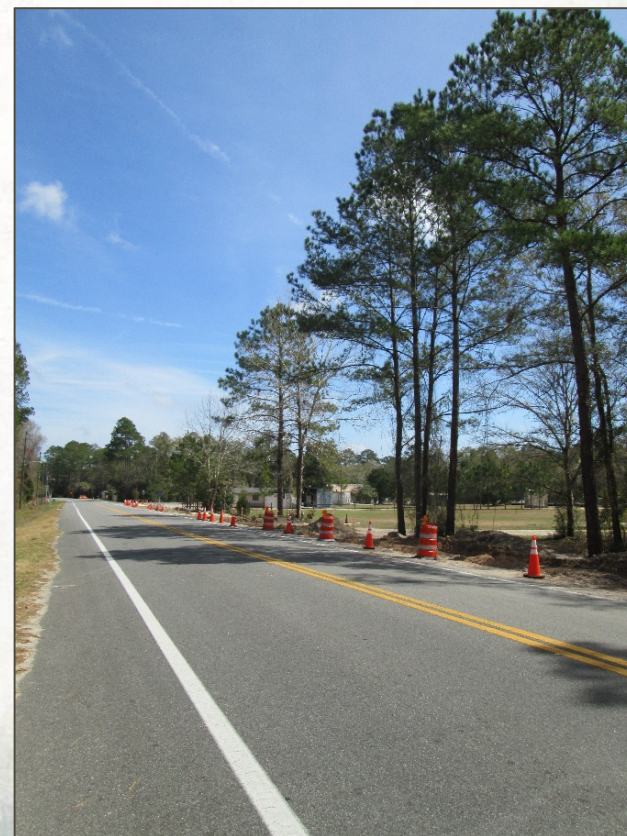
Ochlockonee Bay Trail Phase 5B is currently being constructed