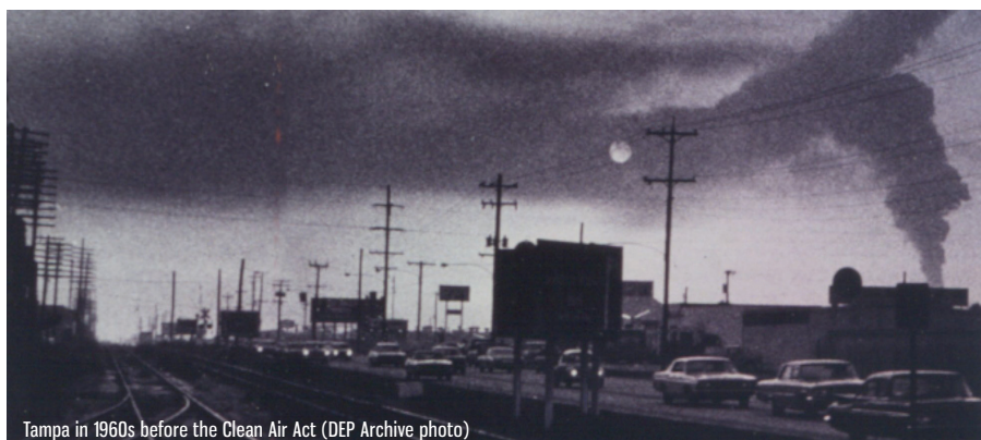
Tampa in 1960s before the Clean Air Act

The U.S. Environmental Protection Agency has established a National Ambient Air Quality Standard for six pollutants: carbon monoxide, lead, nitrogen dioxide, ozone, particulate matter and sulfur dioxide. More information about the drop in air pollutants in Florida is available at FloridaDEP.gov/air .