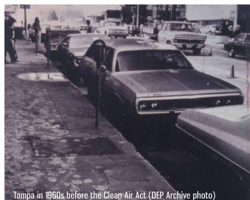
Tampa in 1960s before the Clean Air Act