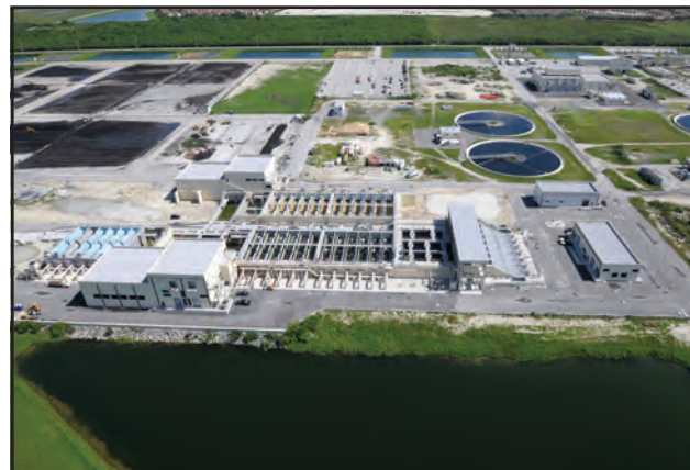
Clean Water State Revolving Fund provided loans for Miami-Dade South District Wastewater Treatment Plant.

Contact: Timothy.Banks@dep.state.fl.us or 850-245-2969