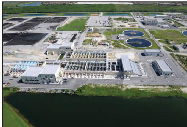
Clean Water State Revolving Fund provided loans for Miami-Dade South District Wastewater Treatment Plant.