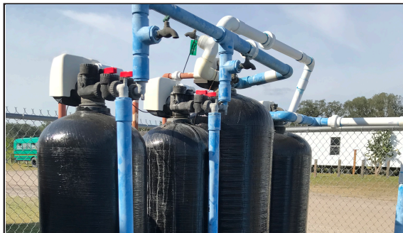
Filter Installation in Polk County