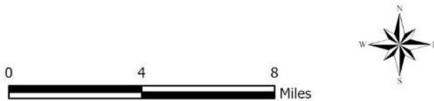
Map 1: FNAI, January 2020