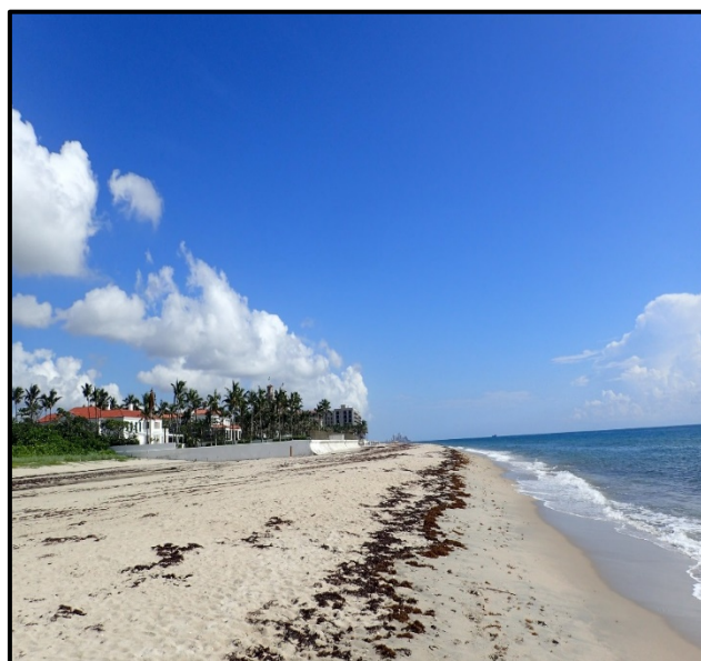
Mid-Town Beach, Town of Palm Beach, August 2018

The Beach and Shore Preservation Act [Section 161.091, Florida Statutes (F.S.)] charges the Florida Department of Environmental Protection (DEP) with developing and implementing a comprehensive, long-range statewide beach management plan. In fulfilling that responsibility, DEP has developed, in coordination with local sponsors and the U.S. Army Corps of Engineers (Corps), a Strategic Beach Management Plan (Strategic Plan), Long Range Budget Plan (Budget Plan) and prioritized list of specific beach erosion control projects for FY 2019-2020, called the Local Government Funding Request (LGFR).