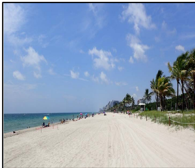
Broward County Shore Protection Project – Segment II, August 2018