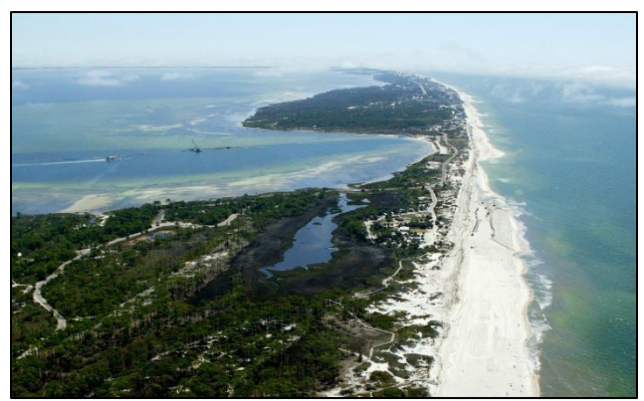
St. Joseph Peninsula Nourishment Project Gulf County - 2019

Beach management projects require time to plan, design, finance, construct, monitor, and maintain. The Budget Plan provides a statewide view of the many individual project efforts. It is used to encourage cooperation and coordination among the local, state, and federal entities and organizations involved in managing Florida beaches. The first year of the Budget Plan summarizes DEP's LGFR submitted to the Florida Legislature for funding consideration in FY 2024/2025. The second and third years (FY 2025/2026 and FY 2026/2027, respectively) list the beach and inlet management projects prioritized in rank order based on funding eligibility and criteria in Chapter 62B-36, Florida Administrative Code, and overall readiness to proceed. Lastly, years four and five (FY 2027/2028 and FY 2028/2029, respectively) list the projects by region and provide the estimated costs of the planned phase. Funding estimates for FY 2025/2026 and beyond are subject to revision by the local sponsor and revalidation by DEP to reflect changes in project scope, cost estimates, project eligibility, and availability of state, local, and federal funds.