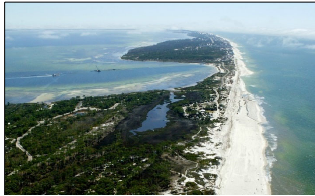
Figure 2: St. Joseph Peninsula Beach Nourishment Project, Gulf County – 2019

Beach management projects require time to plan, design, finance, construct, monitor and maintain. The Budget Plan provides a statewide view of the many individual project efforts. It is used to encourage cooperation and coordination among the local, state and federal entities and organizations involved in managing Florida beaches. The first year of the Budget Plan summarizes DEP’s Local Government Funding Request submitted to the Florida Legislature for funding consideration in FY 2025-26. The second and third years (FY 2026-27 and FY 2027-28, respectively) list the beach and inlet management projects prioritized in rank order based on funding eligibility and criteria in Chapter 62B-36, Florida Administrative Code and overall readiness to proceed. Lastly, years four and five (FY 2028-29 and FY 2029-30, respectively) list the projects by region and provide the estimated costs of the planned phase. Funding estimates for FY 2026-27 and beyond are subject to revision by the local sponsor and revalidation by DEP to reflect changes in project scope, cost estimates, project eligibility, and availability of state, local and federal funds.