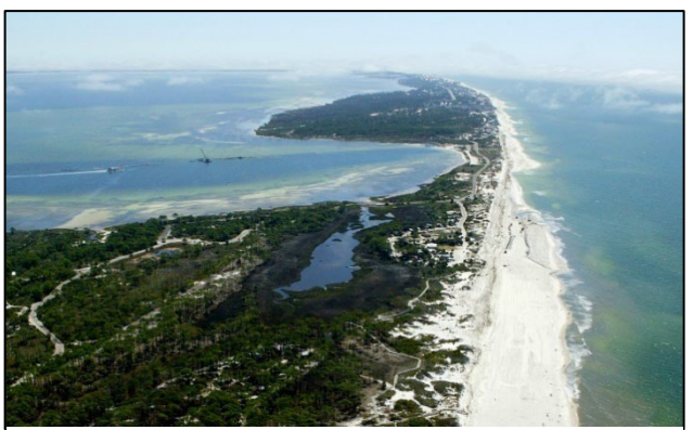
St. Joseph Peninsula Nourishment Project Gulf County – 2019

Beach management projects require time to plan, design, finance, construct, monitor, and maintain. The Budget Plan provides a statewide view of the many individual project efforts. It is used to encourage cooperation and coordination among the local, state, and federal entities and organizations involved in managing Florida beaches. The first year of the Budget Plan summarizes DEP's LGFR submitted to the Florida Legislature for funding consideration in FY 2023/2024. The second and third years (FY 2024/2025 and FY 2025/2026, respectively) list the beach and inlet management projects prioritized in rank order based on funding eligibility and criteria in Chapter 62B-36, Florida Administrative Code, and overall readiness to proceed. Lastly, years four and five (FY 2026/2027 and FY 2027/2028, respectively) list the projects by region and provide the estimated costs of the planned phase. Funding estimates for FY 2024/2025 and beyond are subject to revision by the local sponsor and revalidation by DEP to reflect changes in project scope, cost estimates, project eligibility, and availability of state, local, and federal funds.