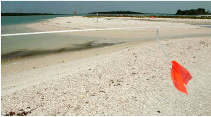
Symbolic fencing protecting beach nesting bird habitat.

For the purposes of negotiations of Offsets with BP in accordance with the Framework Agreement, the Trustees used widely accepted methodologies.