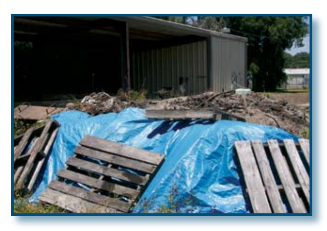
Figure 21. Example of improper handling/storage of solids. An attempt was made to cover the pile with a tarp; however the coverage is not complete, so the rain water can wash and carry away solids from the pile.