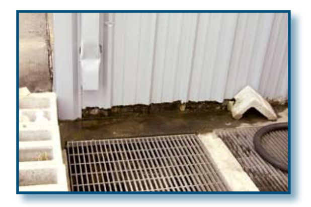
Figure 15. The collection pit at this car wash facility is located outside, adjacent to the wash tunnel. The pit is not covered, there is no overhang, and the downspout brings rain water right into the pit. This situation must be corrected.

Do not allow intrusion of stormwater into the recycle system. Install overhangs, roofing, or other devices on buildings. Also, install curbs around wash bays or tunnel entrances (or elevate bays or tunnels) as appropriate. This will avoid the overloading of the system's storage capacity, and the potential to cause a discharge.