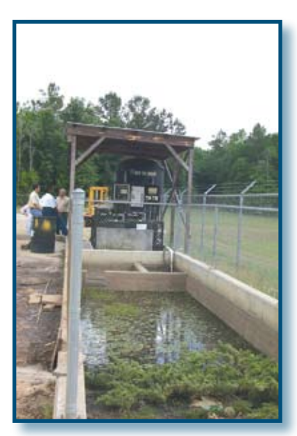
Figure 17. This facility does not have a roof or other cover over the wash area. As a result, excess stormwater occasionally creates an overflow of wastewater into the stormwater pond adjacent to the system. This is not a desirable situation.

If a wash pad can not be covered with a roof for various reasons (including cost), another way to prevent stormwater from overflowing the system, is to install a stormwater diversion valve. This allows the system to discharge uncontaminated stormwater runoff from the wash pad to an appropriate stormwater outfall when the pad is not in use.