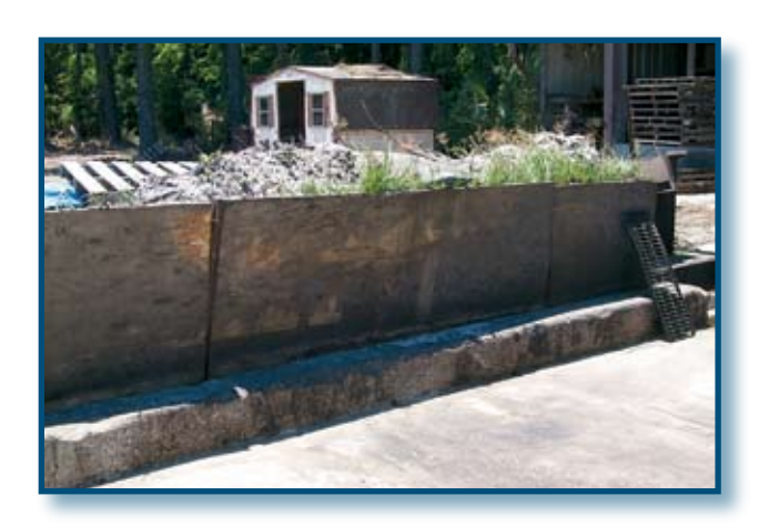
Figure 20. Example of improper storage of solids. The material is not completely covered and as a result, the rain water can wash it away.

If it is not practical to store material awaiting disposal in closed containers, the material should be well covered with a tarp to prevent stormwater contamination.