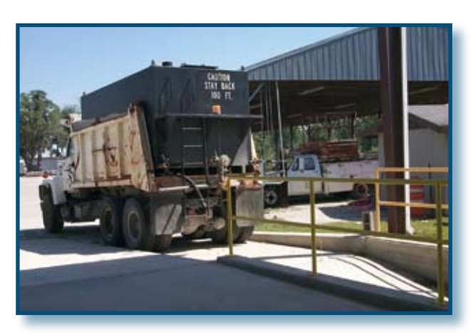
Figure 24. Pumpout truck used to remove the sludge from the settling tank at this facility.

Plate and frame filters, pressure sand filters, mixed media filters, and pressure leaf filters can be used in car wash operations for final rinse water treatment. Particles larger than 40 microns must be removed from the recycled water to prevent equipment wear and abrasions on car finishes.