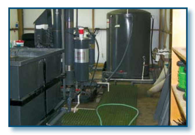
Figure 27. Example of good housekeeping.