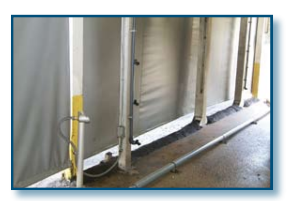
Figure 11. The gap between the overspray abatement curtains and the curb at this car wash facility allows wash water to escape outside the impervious area.

It is recommended to enclose the washing areas with walls to prevent the dirty overspray from leaving the area. Also, the floors should be properly graded to allow the wash water to drain into the collection pit or sump.