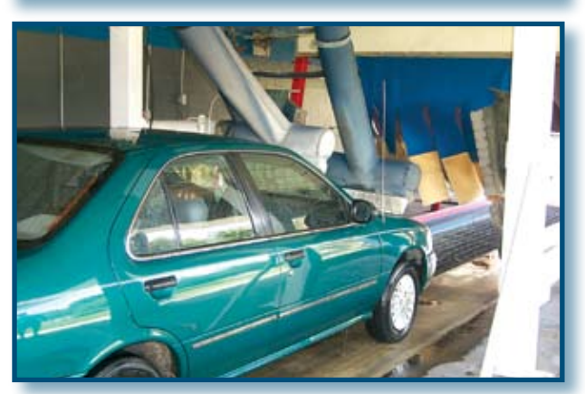
Figures 2, 3 and 4. Examples of a tunnel car wash.