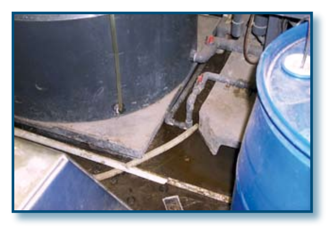
Figure 26. Scattered pieces of different materials in a puddle of liquid on the floor are signs of poor housekeeping. Poor housekeeping creates safety hazards, as well as operational problems.

• Water conditioners on the market may be used as additives to the 100% closed-loop recycle system. These conditioners help maintain a good water quality, help in releasing and flocculating of suspended solids, help soften the water, inhibit corrosion on the system, and lower the total suspended solids (TSS) count which improves the color and quality of the recycled water. It has to be noted, however, that while the additives can have a positive effect on some water qualities, at the same time their use increases the Total Dissolved Solids (TDS), which is a negative effect.