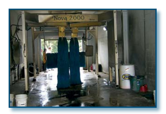
Figure 1. Example of a rollover car wash. The wash water is well confined inside the system. Also, no significant amount of rainwater is introduced into the system.

1. Rollover car wash is a car wash where the vehicle remains stationary while washing, rinsing, waxing and drying equipment passes over the car.