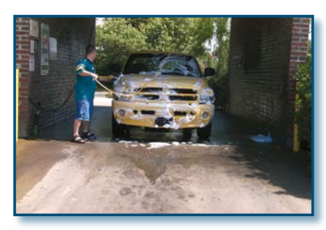
Figure 5. View of a wand car wash.

3. Wand car wash is a self-service car wash where the vehicle remains stationary and the car is washed using a high-pressure stream of water from a hand-held wand.