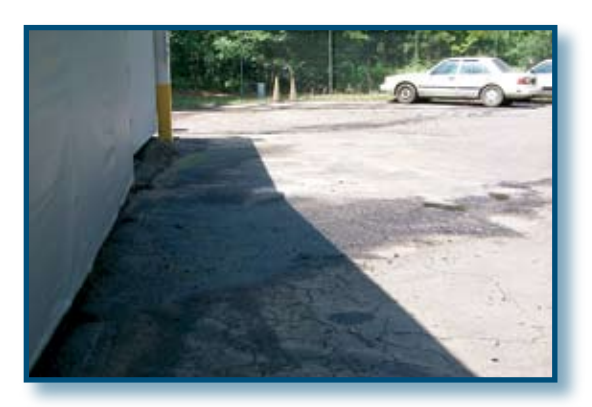
Figure 12. Outside view of the same facility. Because of the improper containment, the wash water runs outside, off premises, and onto the ground.

Washing areas should not be located near uncovered vehicle repair areas or chemical storage facilities, to prevent the transport of chemicals in the wash water runoff.