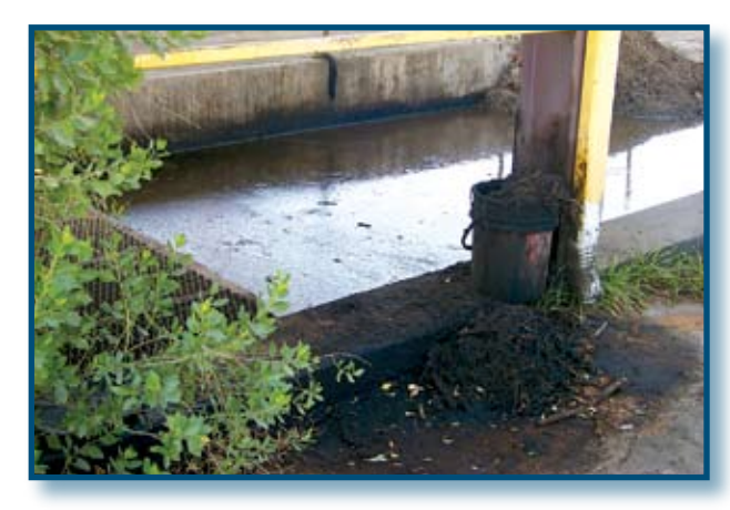
Figure 19. The solid waste collected from the settling pit is improperly stored in an open bucket. The waste should be stored in a closed container until ready to be sent to a class I or II sanitary landfill.

or sumps from overflowing. Used filters and other solid waste must be stored in covered containers until ready to be sent to a landfill.