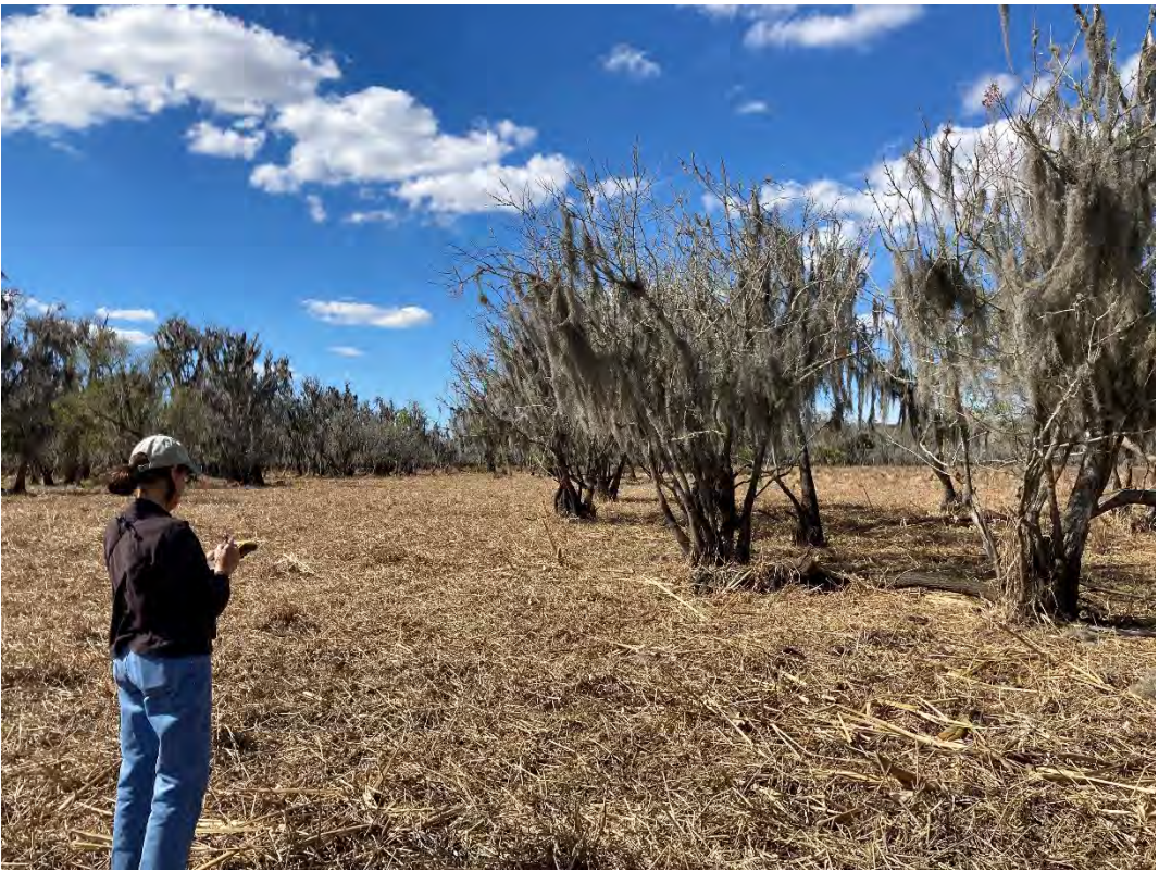
5. Historic Basin Swamp (altered) along Charlie Creek.