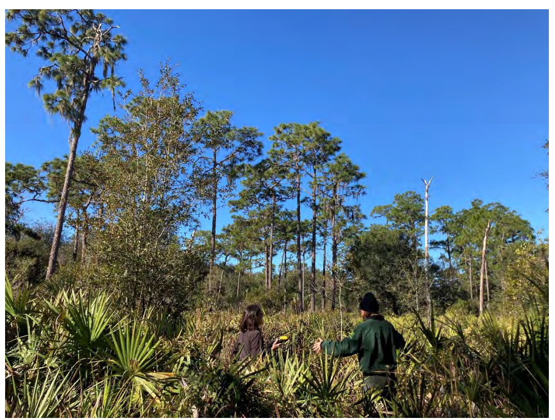
6. Mesic Flatwoods