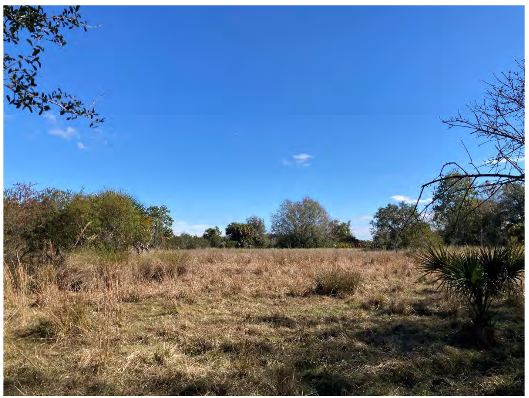
1. Semi-improved pasture