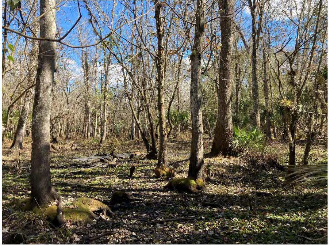
4. Basin swamp