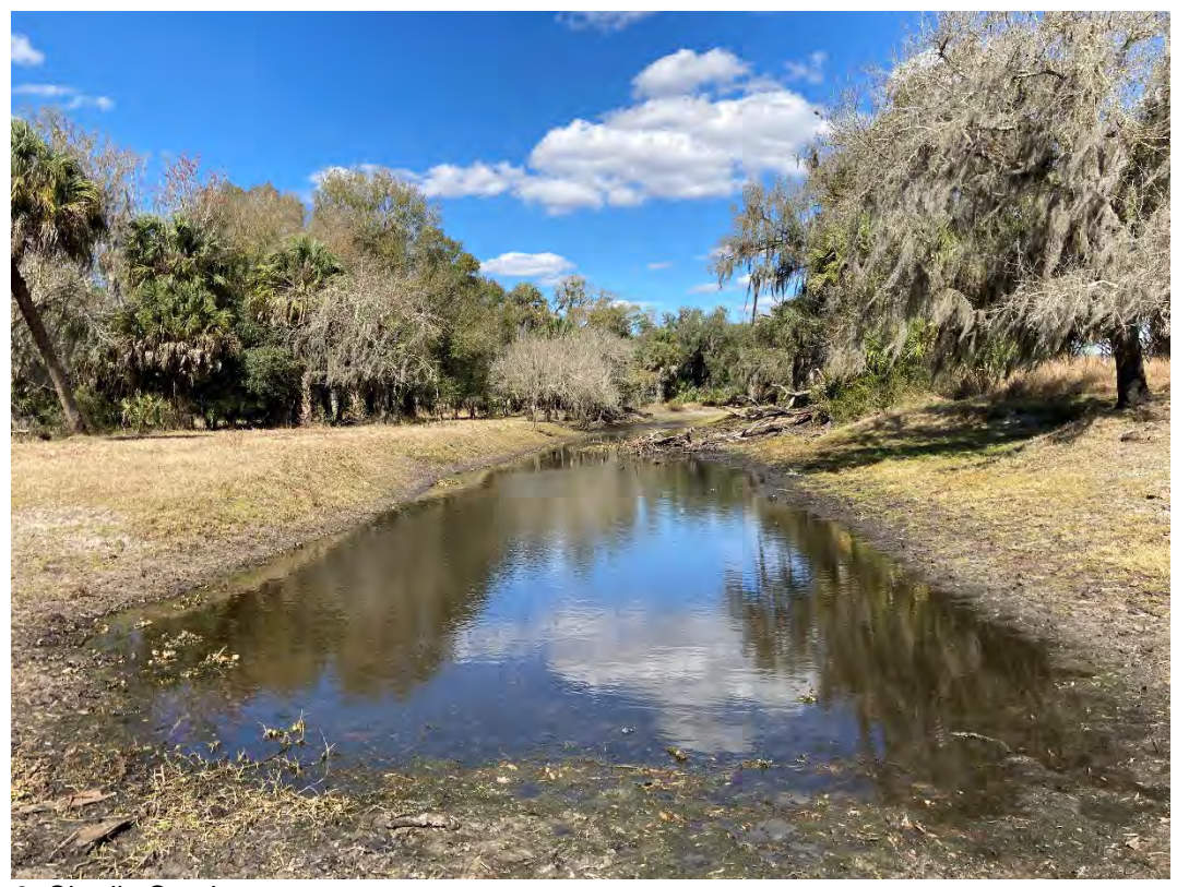
3. Charlie Creek