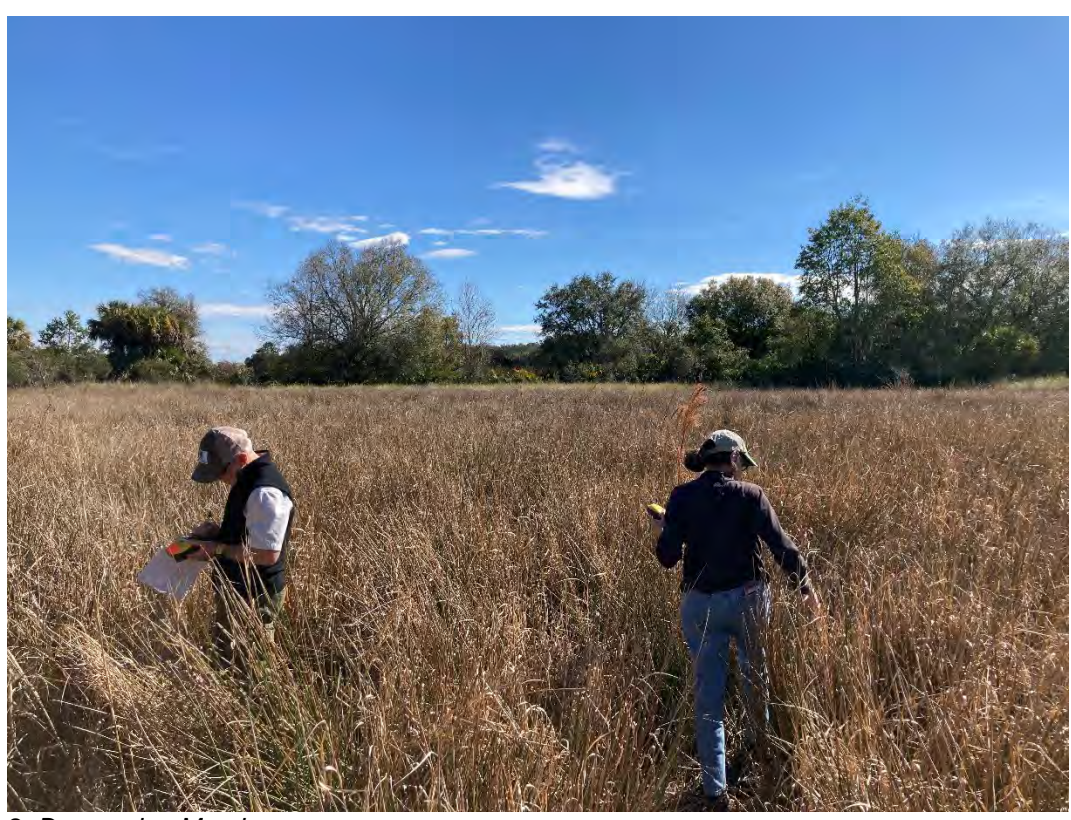
2. Depression Marsh