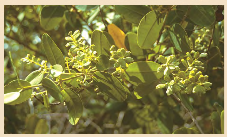
White mangrove leaves and fruits

Trimming Guidance: The white mangrove is the most tolerant of trimming, including hedging. They have reserve growth capability in their meristem. The meristem is a tissue along their trunks, and can provide reserve energy to help the tree recover from trimming. White mangroves can develop blocked vessels leaving parts of older trees weak. When trimming white mangroves, trim for balance of their weight as well as how they look.