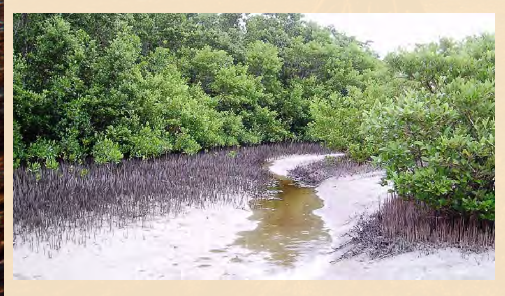
Mangrove forest growing in a tidal basin

Pre-trimmed height: The height of the mangroves immediately prior to any trimming event, whether it be the first time trimming, staged trimming, or maintenance trimming.