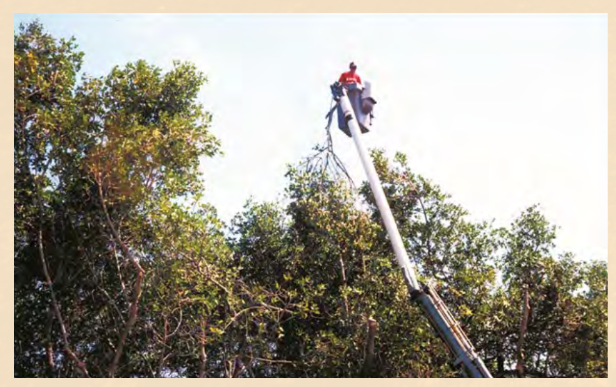
Professional Mangrove Trimmer

Note: Membership in an organization generally does not constitute certification by that organization.