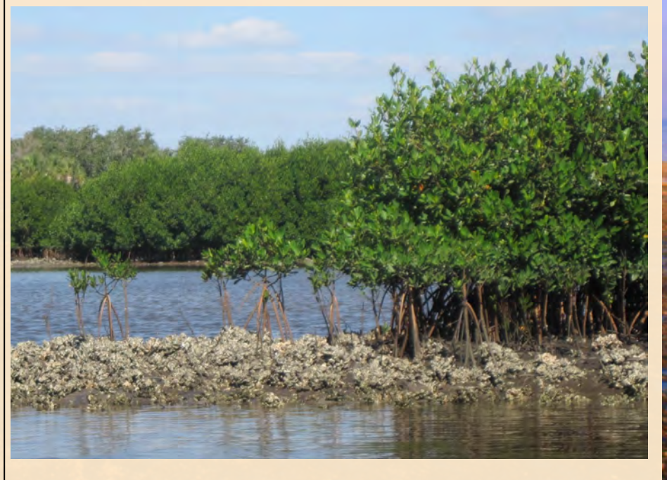
Red Mangroves "Walking"