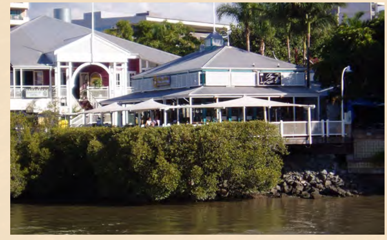
Mangroves along your seawall or rip rap provide additional fortification to the cement and rock structures.