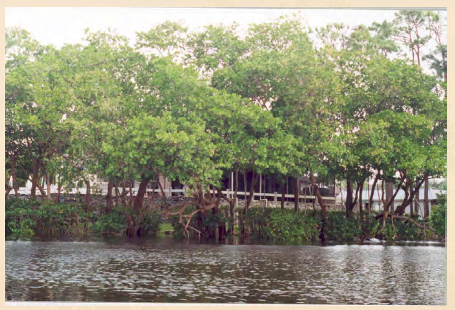
These windowed mangroves provide the homeowner with a view from the first floor and privacy from the second.

Styles of trimming: Regardless of who conducts the trimming, contact your county extension service office (IFAS) or the <u>International Society for Arboriculture</u> for additional information on standard horticultural practices, & read page 10 of this booklet for caution while trimming red mangroves. Mangroves can be trimmed in a variety of ways that can provide a view while still protecting the health of the tree. There are also some excellent and easy to read books available from libraries, bookstores, and the internet for this purpose. Both the property owner and the trimmer are responsible for trimming mangroves in a manner that will not cause defoliation, destruction, or removal of the mangrove and in accordance with the 1996 MTPA. (Refer to Page 7, Trimming for Healthy Plants , and Pages 8 & 9 for Trimming Styles .)