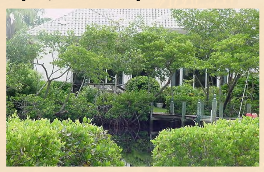
Windowed and hedge-trimmed Mangroves along shoreline and dock

Regulations: The heights to which a mangrove tree may be trimmed will depend upon the provisions of the MTPA as well as the species and condition of the tree. In most instances, mangroves may not be trimmed lower than 6 feet in height as measured from the substrate (ground surface) under the MTPA, except for certain government and utility oriented exemptions, and historically established and verified configurations. Reduction in height for larger trees will need to be conducted in stages over several years. Many large trees cannot legally be trimmed to 6 feet; this is mainly due to the tree's pre-trim canopy configuration. In no case may trimming result in defoliation (loss of most of the tree's leaves), destruction (death of part or all of the tree, including roots), or removal of a mangrove.