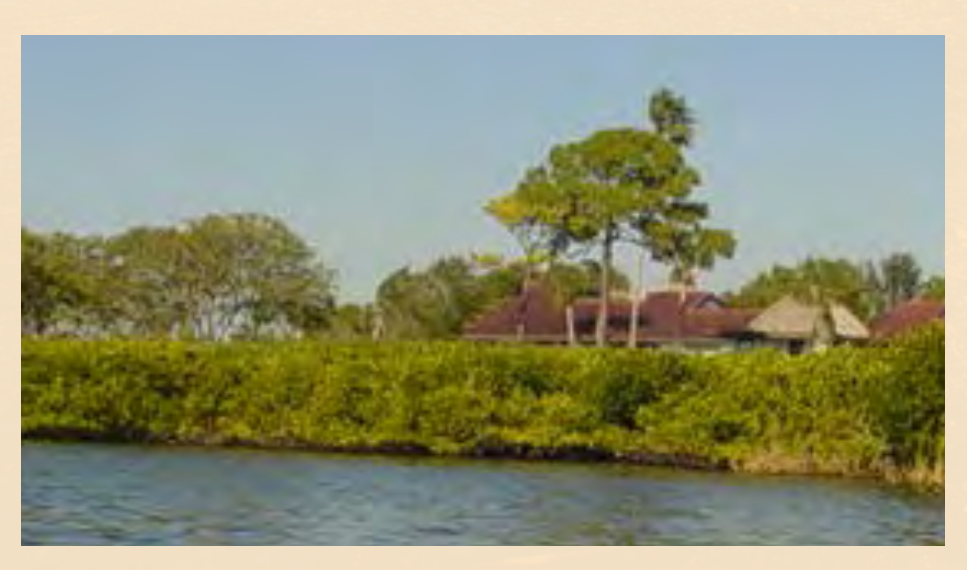
Mangroves growing along a riparian shoreline

Lands set aside for conservation or preservation: These lands may be publicly owned such as parks (see S. 403.9325(6), F.S.), or privately owned such as conservation easements (see 'Property restrictions'). S. 403.9323(2), F.S. specifically precludes trimming from occurring in these areas without a management plan or statement that specifically allows mangrove trimming. (Professional mangrove trimmer 'PMT', page 17).