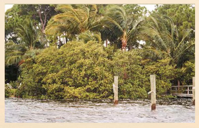
These homeowners decided to let their mangroves grow naturally. A small path provides access to their pier.