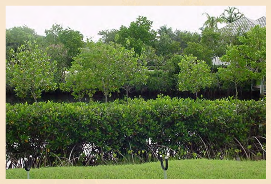
Hedged trimmed mangrove fringe

Riparian Mangrove Fringe (RMF): Those areas where the mangroves start growing along the shoreline (see 'shoreline'), do not exceed 24 ft. in height, and the band of mangroves along a shoreline is no more than 50 feet from the most landward trunk to the most waterward trunk in a line perpendicular to the shoreline. The RMF exemptions may not be used on uninhabited islands, mangrove islands, mitigation areas, or public or private lands set aside for conservation or preservation unless the documents for such areas specifically allow for mangrove trimming. RMF trimming is exempt from the need for permits (see page 16, for Exemptions).