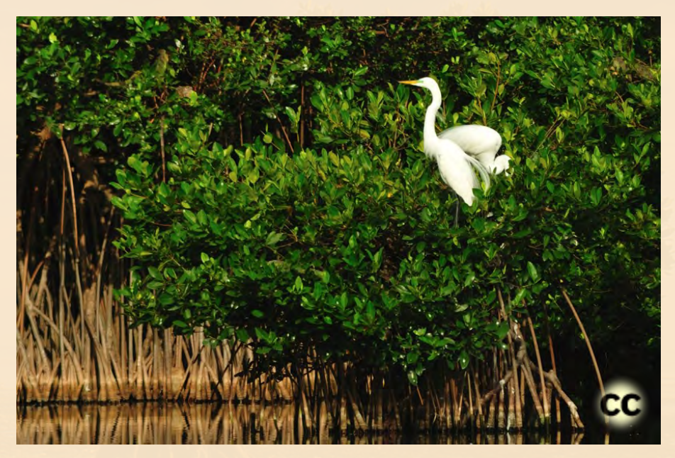
Great Egret standing on a Red Mangrove Tree

The Florida Marine Research Institute has reported up to 86% loss of mangroves in some areas of Florida since the 1940's. Trimming mangrove trees and shrubs into short hedges results in a loss of mangrove