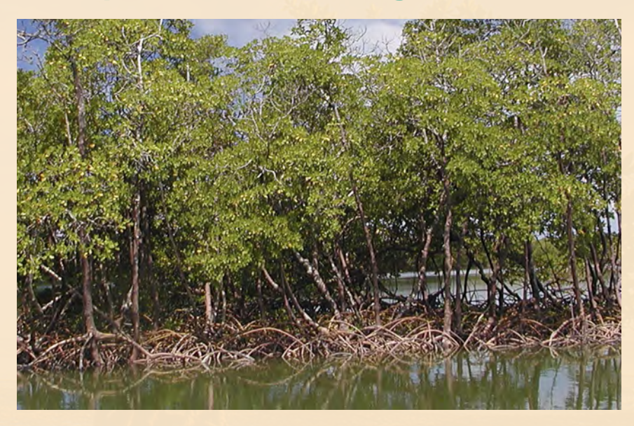
Group of Red Mangrove emerging from the water

Trimming Guidance: Red mangroves are the most susceptible of the mangroves to damage from severe trimming. Red mangroves primarily grow from their branch tips "apical meristems". When most of the leaves and apical meristems are removed, the tree's survival is very doubtful because red mangrove stems greater than one inch thick do not grow back. This is why topping of red mangroves can be so damaging. Most horticultural web sites and publications warn against topping trees. Red mangroves rarely recover from severe trimming and do not resprout most trimmed branches. These trees are best cut by trimming windows from the lower part of the canopy, so long as the bottom of the window is at least 6 ft. from the substrate to prevent illegal trimming of young mangroves growing into the windowed area. Remember that cutting of the aerial/prop roots is prohibited without authorization. The smooth roots are readily distinguished from the stems which have obvious scar rings completely encircling them.