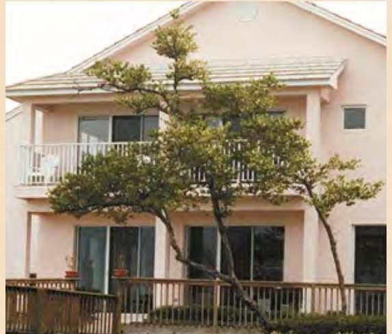
Upper and lower views of a windowed black mangrove

Black mangrove propagules (lima-bean shaped) are much smaller than red mangrove propagules and light gravishgreen. They are not as hardy as red mangrove propagules, but can be free floating for several weeks before sprouting roots in a suitable environment. Black mangroves can tolerate more saline conditions than other mangroves and generally grow landward of the Mean High Water Line (MHWL).