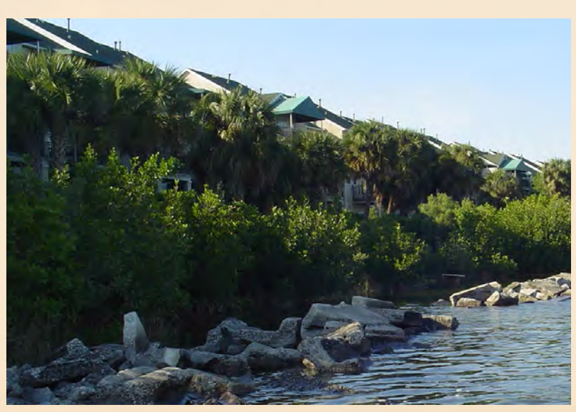
Mangroves along homeowners' shoreline with rip rap.

Actions that result in defoliation, destruction, or removal of a mangrove are considered alteration.