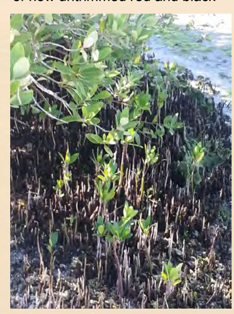
Characteristic pencil-like 'pneumatophores' of a black mangrove

Trimming Guidance: Black mangroves handle most trimming fairly well, however mature black mangroves are susceptible to excessive trimming and do not recover as well as younger trees. Because black mangroves have such strong, dense wood and are great wind breakers, windowing of the larger diameter trees is highly recommended. Following the hurricane season of 2005, the Department received many accounts of how untrimmed red and black