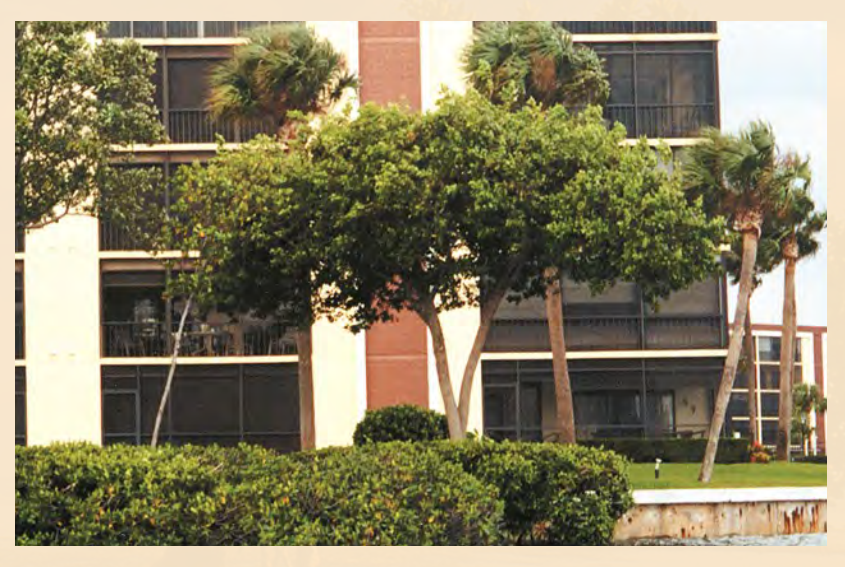
White mangrove tree with two trunks and a balanced canopy over a mostly white mangrove hedge