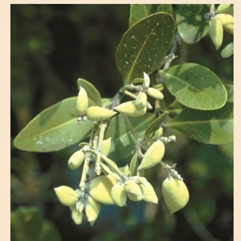
Black mangrove leaves and fruits (propagules)

mangrove fringes saved property owners from incurring extensive property damage. These accounts occur worldwide and go to show the ability of mangrove fringes in protecting coastlines. Mangroves grow freely and are less costly to replace than seawall, riprap and roofs.