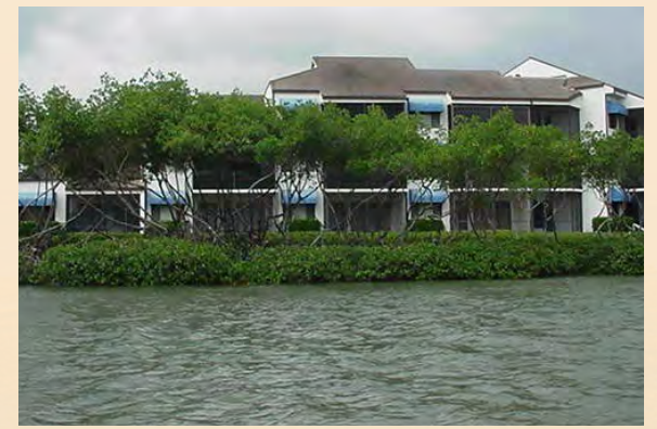
Windowed Red Mangroves along a residential complex

Before trimming try to determine exactly where you would like a view and try to limit the trimming as much a possible. Trees can provide privacy and block the brightness of your neighbor's lights. If you are hedging the trees, consider leaving some areas with uneven heights or emergent stems to provide habitat and richer detrital output than flattopped compact hedges. Alternate trimming styles can provide a 'healthier' view.