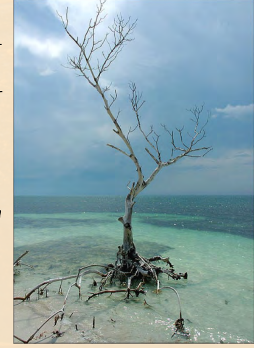
Dead Mangrove along the shore

Mangrove: The 1996 MTPA defines the word mangrove to mean any specimen of the three native Florida species ( Rhizophora mangle, Avicennia germinans, Laguncularia racemosa ), also known as the Red, Black, and White mangroves. The Act does not distinguish between living and dead mangroves. Trimming regulations apply to both equally.