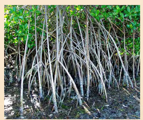
Red Mangrove prop-roots

Red mangroves (Rhizophora mangle) are characterized by their arching 'prop roots'. These roots, also referred to as 'aerial' or 'stilt' roots, extend from the main trunk and lateral branches and grow down into the substrate. Prop roots provide support for the tree and assist in