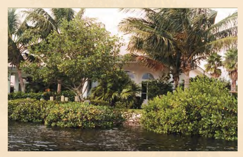
A combination hedged and windowed Mangroves along with other landscaped plants

Design a view and that is comfortable for you while considering the benefits mangroves provide to your home, property, and the economies of our coastal counties and the state. Refer to species description section for additional trimming information.