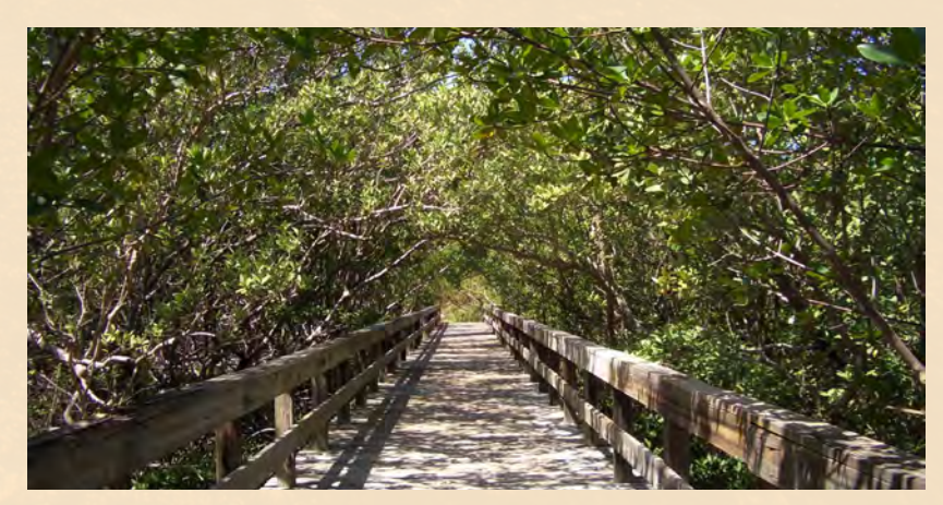
Trimmed Mangroves arching over boardwalk in Lovers Key

No permit or PMT is required to trim or alter mangroves within the footprint of an activity that has been exempted under S. 403.813 (1), F.S. or permitted under Part IV of Ch. 373, F.S. For example, one may trim the mangrove branches hanging directly over one's dock.