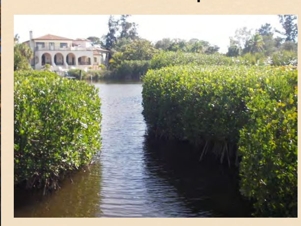
Hedged-trimmed Red Mangroves

Windowing: Is a view through large trees that can be obtained by selective limb removal within the lower or central area of the tree. Windowing allows for a view while maintaining shade, privacy, windbreak, and additional habitat for wildlife (especially birds). The bottom height of a window may not be lower than 6 ft. from the substrate. Arborists recommend that the window openings be no more than 1/3 of the canopy for smaller trees and not more than 1/5 of the canopy of larger trees.