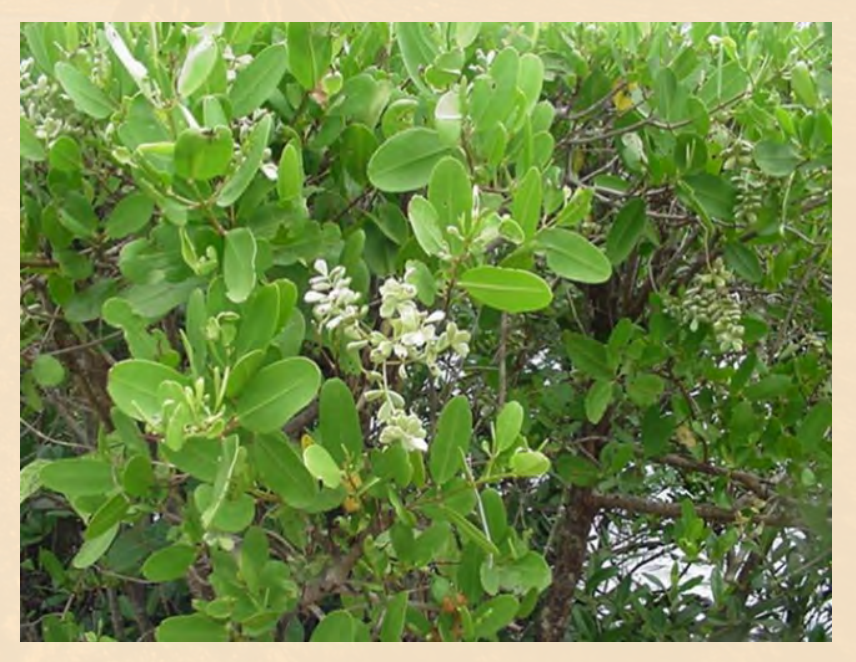
White Mangrove flowers and paddle-shaped leaves