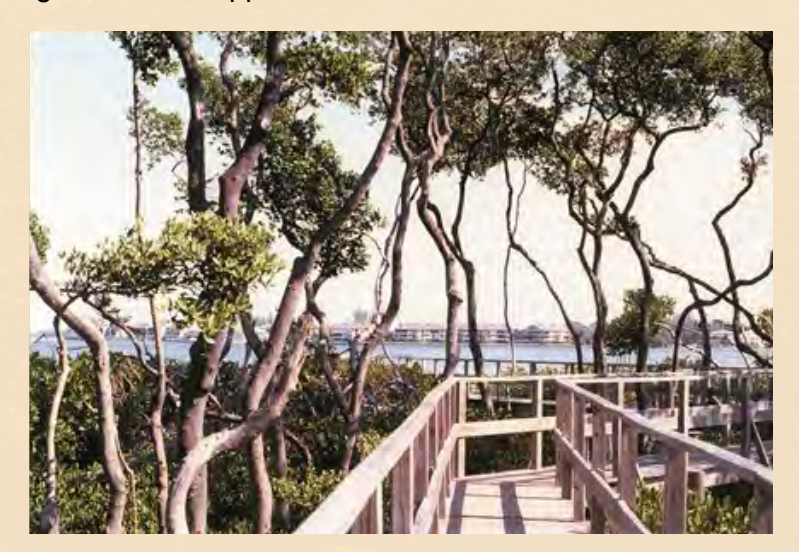
An Individual Permit should be used if mangrove alteration is possible from trimming or exotic removal

The <u>application</u> must provide the entire scope of the proposed activity and how it will be conducted. A fee of between $420 and $830 is required (depending on the number of mangroves to be trimmed or altered). Agency staff should be contacted for additional information. Pre-Application meetings are highly recommended for both GP and IP trimming to save the applicant time, effort and cost.