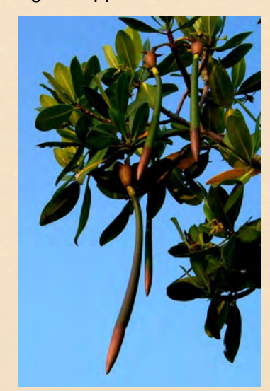
Red Mangrove propagules

Red mangrove leaves are the largest of the three species. They are elliptical, glossy and dark green on top, and paler, dull green, often with tiny black spots, underneath. All three species have leaves that grow opposite each other