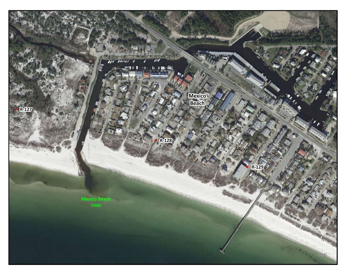
Figure 2. Aerial photograph from 2017 of Mexico Beach Inlet.

Mexico Beach Inlet is in eastern Bay County on the northwest gulf coast of Florida between Tyndall Air Force Base to the west and the City of Mexico Beach to the east and is located between FDEP range/ reference monuments R127 and R128 ( Figure 2 ). Mexico Beach Inlet connects the Gulf of Mexico with a canal system within the City of Mexico Beach. The channel leading to the inlet entrance follows the historic path of Salt Creek, a tidal creek that was periodically open that connected to Bear Swamp to the north.