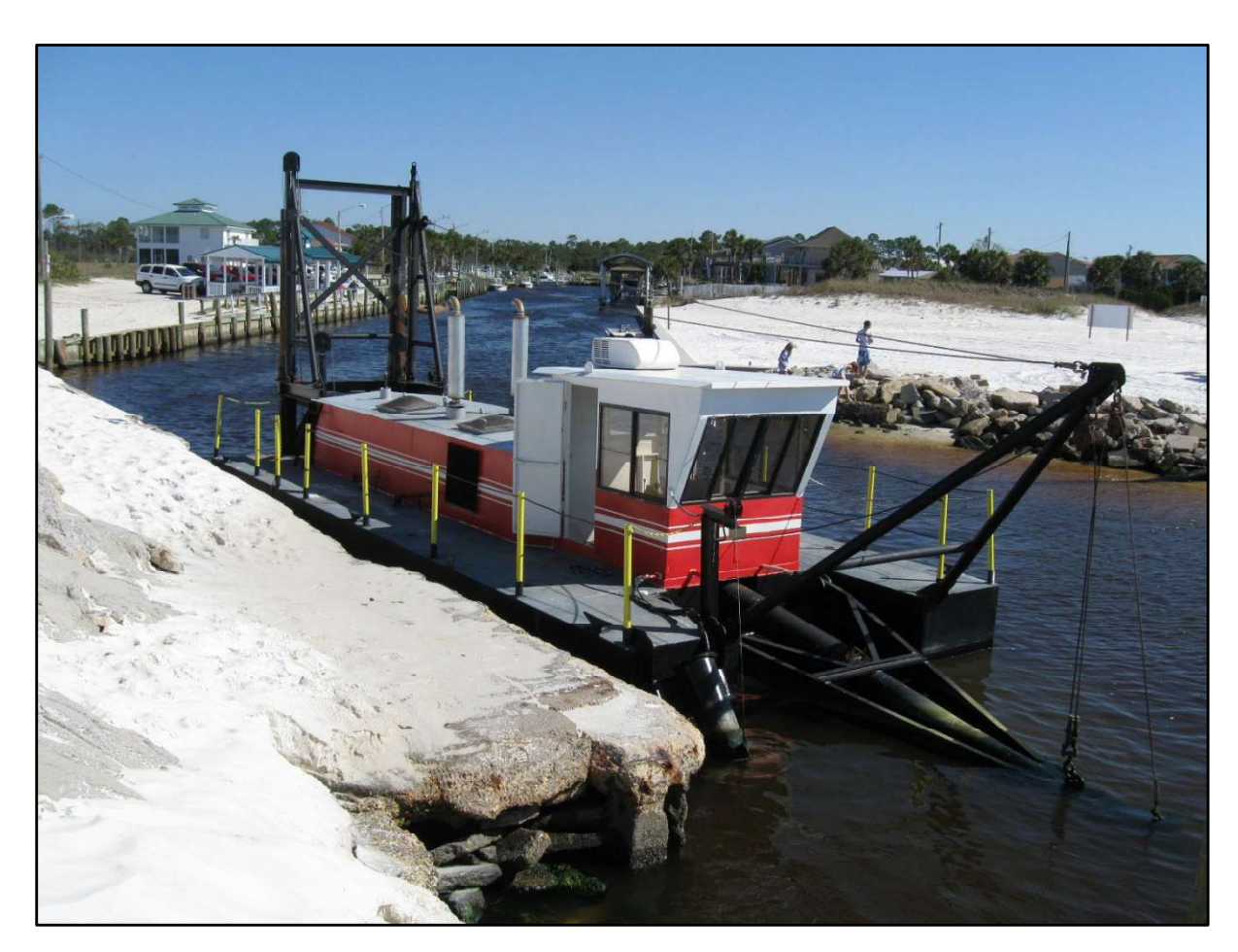
Figure 3. The Mexico Beach Inlet dredge in 2010.

local interests seeking small craft navigation access to the Gulf of Mexico for recreational fishing ( Figure 3 ). The interior canal system is aligned generally west to east along the northern limits of the city for approximately 10,000 feet and has an unmaintained eastern gulf connection that drains Cypress Creek located at FDEP range/ reference monument R138.