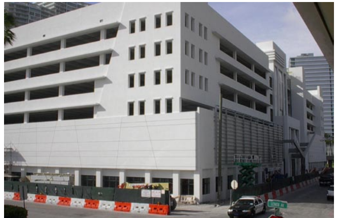
AR&J SOBE/Former Potamkin Properties