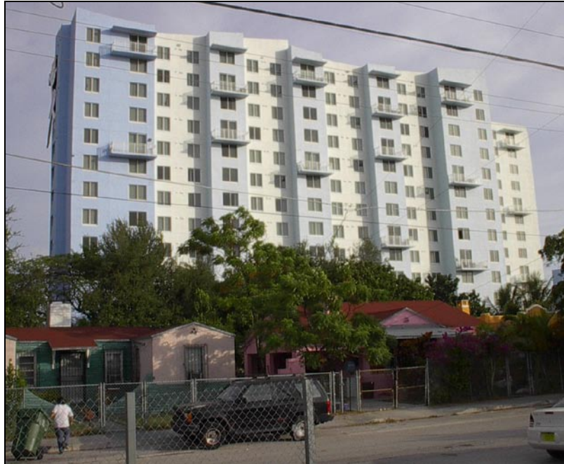
Los Sueños Apartments