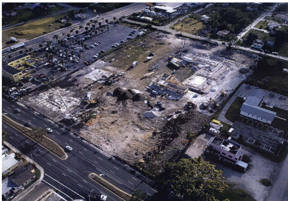
The Corinthian prior to site construction - April 13, 2006

groundwater contamination. A conditional closure, with engineering and institutional controls, has been elected for the site. Construction of the apartment building was completed in July of 2007. The engineering control has been completed. Groundwater impacts at the property boundary have been documented and require remedial action to prevent off-site migration.