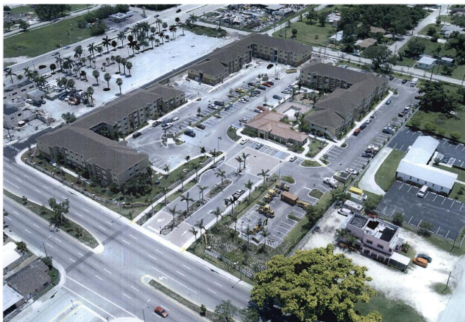
The Corinthian completed - June 8, 2007