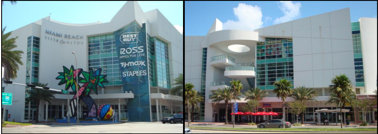
AR&J SOBE/Former Potamkin Properties