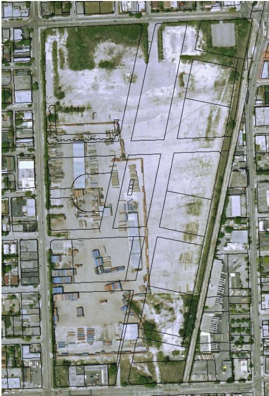
Midtown Miami prior to site development - 2003

in pursuit of a No Further Action with Conditions site closure. The development is mixed use and when completed will consist of 600,000 square feet of retail space, 3,000 condo lofts and 350 apartment units. It will have an estimated development value of $1.2 billion and will generate an estimated 1,700 permanent jobs.