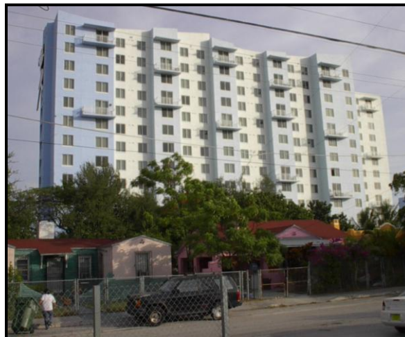
Completed Los Sueños Apartments