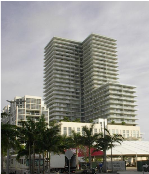
Midtown Miami - 2008