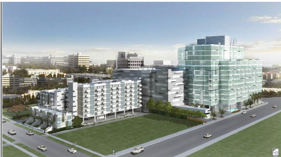
Artistic rendering of the proposed development Wagner Square