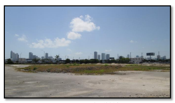
Vacant site (2014)

On October 14, 2005, McArthur Dairy Inc. executed BSRA (BF139801005) for the property located at 2451 NW 7 Avenue. McArthur Dairy operated a dairy products distribution facility with a fleet management garage at the site until March 31, 2008. Oil water separators, hydraulic lifts, and underground storage tanks were removed and the site is now vacant. The site assessment was completed and approved on January 28, 2011. Groundwater monitoring was conducted in support of a No Further Action with Conditions Closure. The contaminants of concern include Volatile Organic Compounds, Phenols, Polycyclic Aromatic Hydrocarbons, Total Recoverable Petroleum Hydrocarbons and Arsenic. Submittal of a Declaration of Restrictive Covenant Package is pending.