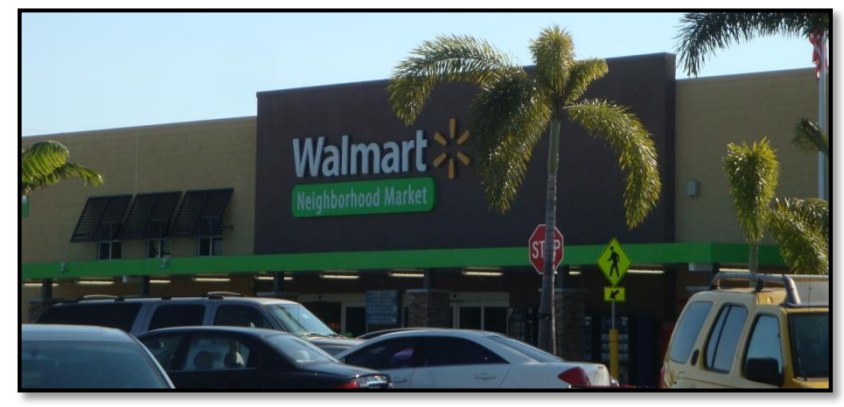
Constructed Walmart (2015)

On December 31, 2012, Walmart Stores East, LP executed a BSRA (BF131201001) for the property located at 1499 Homestead Boulevard. The site previously operated as an automotive dealership and mechanical repair shop until 1996. Oil water separators, hydraulic lifts, and underground storage tanks were removed from the site. The site assessment was completed and approved on December 6, 2012, and documented Volatile Organic Compounds and Polycyclic Aromatic Hydrocarbon groundwater contamination. Groundwater monitoring is being conducted for a No Further Action site closure. The Wal-Mart Neighborhood Market opened in January of 2014 and created up to 95 full and part-time jobs.