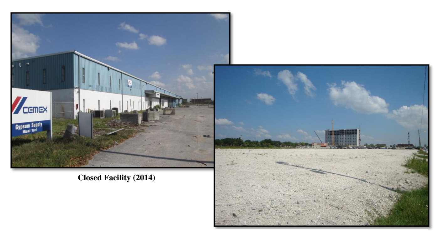
Cleared lot (2015)

On December 31, 2013, a BSRA was executed between MDC and Proccaci 1400, LLC for the property at 1400 NW 110<sup>th</sup> Avenue (BF130843002). Cemex formerly operated at this facility. Records at DERM also indicate the underground storage of petroleum products between 1987 and 1993. The eastern portion of this property is encompassed by the former Marks Brothers Dump/Lakefill and contains buried solid waste. Site improvement and development activities were initiated in 2014 in accordance with plans approved by DERM, and a Certificate of Construction Completion was received in February 2015. Site assessment is being conducted. The site will be redeveloped as a hotel.