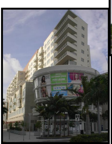
Midtown Miami (2008)

A BSRA (BF139801002) was executed on December 24, 2003, with Biscayne Development Partners, LLC, for the Midtown Miami/former Buena Vista site located at 3111 N. Miami Avenue. The site was formerly owned by the Florida East Coast Railway and was used as a storage yard for freight containers in the maritime transport of goods. The contamination assessment documented lead and arsenic in the soil and arsenic and petroleum contamination in the groundwater. This site is currently in the institutional and engineering control plan phase in pursuit of a No Further Action with Conditions site closure. The development is mixed use and when completed will consist of 600,000 square feet of retail space, 3,000 condo lofts and 350 apartment units. It will have an estimated development value of $1.2 billion and will generate an estimated 1,700 permanent jobs. Construction has commenced on an additional two tracts for retail space (Wal-Mart) and residential space (multi-story apartments). The remaining tracts have interim engineering controls.