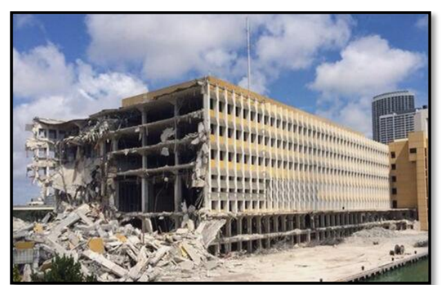
Demolition of Miami Herald Building (2014)