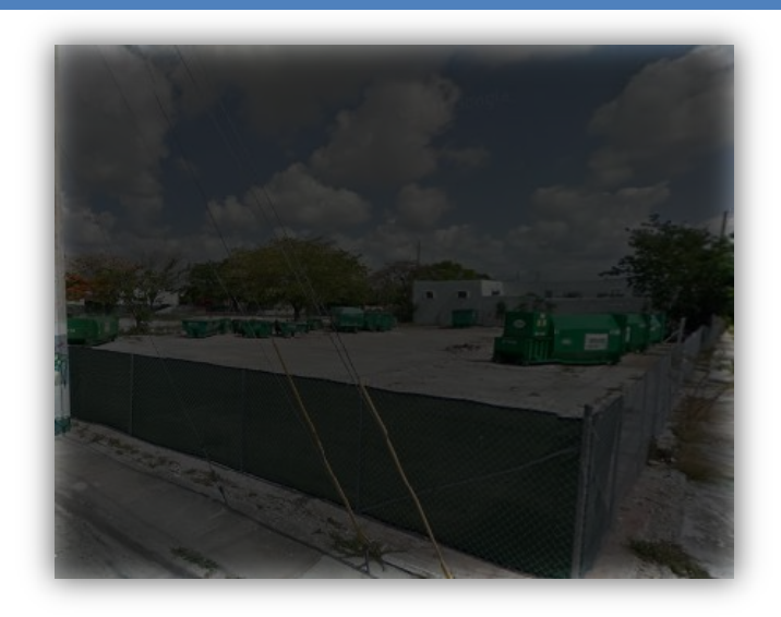
Vacant Lot (2015)

Wynwood Owner, LLC entered into a BSRA (BF 139801009) on June 24, 2014 for the Wynwood Vacant Parcels property located at 2110, 2118 & 2134 North Miami Ave and 2101, 2129 & 2135 North Miami Court, Miami. The property is proposed to be redeveloped as mixed use residential commercial land use with a projected 150 units per The property has been developed commercially since at least 1926, historically conducting manufacturing operations, lumber work, metal/wielding works and automobile repair. A Phase I/II and Site Assessment has been completed for the property, which documented groundwater contamination consisting of Isopropylbenzene, Polycyclic Aromatic Hydrocarbons, Chromium and Lead. Further assessment is pending.