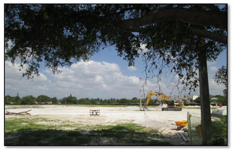
Vacant Site (2014)

Manufactured Gas Plant (MGP) that began operation in 1930. DERM records indicate that the parcel was mainly used for gas storage, which ceased in 1984. The site rehabilitation activities conducted since 1984 have consisted of assessment, soil removal (also targeting residual coal tar) in the late 1980s and early 1990s, hydraulic pump tests in 2007 and a biosparge/soil vapor extraction pilot test in 2010. Between December 2013 and May 2014, an Interim Source Removal (ISR) was implemented to address all the direct exposure risk concerns from contaminated surface soils within the site and to remove observed visible MGP residual