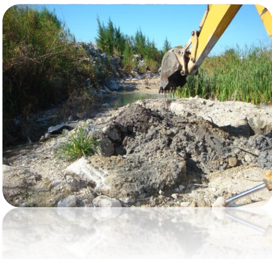
Medley Redevelopment Site (2012)