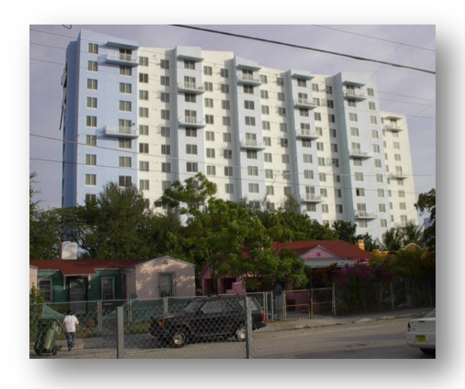
Completed Los Sueños Apartments

On December 20, 2004, a BSRA was executed with Dreamers, LLC (BF139801004) for the property located at 500 NW 36 Street, which formerly housed an automobile repair facility with underground storage tanks. Contamination assessment identified concentrations of Volatile Organic Compounds and Polycyclic Aromatic Hydrocarbons in the groundwater above the applicable cleanup target levels. An engineering control was implemented to address petroleum-impacted soils. This property was redeveloped as Los Sueños multifamily apartments, consisting of a high-rise residential tower and parking garage. A Monitoring Only Plan for the groundwater was approved on February 27, 2013.