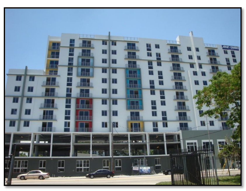
Site construction nearing completion (May 2015)