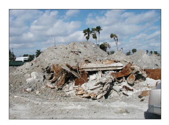
Solid Waste Removal

On April 9, 2003, Biscayne Commons, LLC, entered into a BSRA (BF130201001) for redevelopment of a former landfill located at 14700 Biscayne Boulevard in the City of North Miami Beach. Solid waste was compacted, utility trenches were completed and a shopping center was constructed in 2005. A methane gas abatement system was approved and installed. Methane and ammonia groundwater monitoring are being conducted.