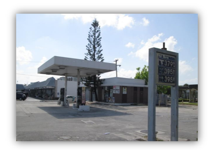
Out of service gas station (2014)

On March 13, 2013, a BSRA was executed for Land South Partners I Brownfield Site located at 1600 NE 123 Street (BF131301001). The site formerly operated as a gas station and has documented contamination associated with a 1988 petroleum discharge. The site is being redeveloped for commercial and/or retail use. The underground storage tank systems were removed in February 2015 and demolition of the site's one story building occurred May 2015. Site assessment activities are being conducted.