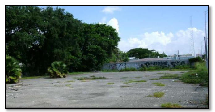
Southern portion of site prior to development (2013)

A BSRA was executed on March 17, 2014 for the St. Martin's Place facility (BF139801008), located at 1128, 1154 and 1170 NW 7<sup>th</sup> Avenue in Miami. The subject site was formerly occupied by several businesses including an auto repair facility. Site assessment activities were completed and documented the presence of chlorinated solvent constituents in the groundwater in the southeastern corner of the site attributed to migration from the former Biscayne Chemical facility located to the northeast of the subject site. Site assessment activities also documented limited Polycyclic Aromatic Hydrocarbons soil impacts which were addressed through source removal. A Site Rehabilitation Completion Order was issued on December 18, 2014. There are restrictions on use of groundwater at the site based on the groundwater contamination originating from an off-site source. The vacant land is currently being developed into multi-family, transit-oriented, affordable housing.