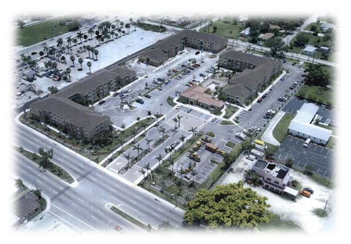
The Corinthian completed (June 8, 2007)