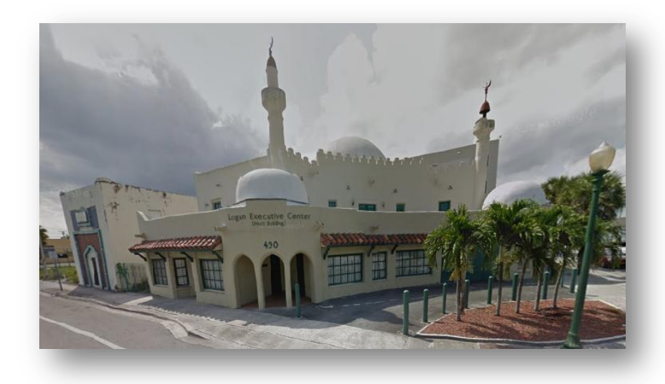
Historic Hurt Building(2015)

The Opa-Locka Community Development Corporation, Inc. (OLCDC) entered into a BSRA (BF139901002) on September 26, 2014 for the OLCDC Property (historic Hurt Building) located at 432 (formerly 409) Opa-Locka Boulevard within the city of Opa-Locka. The OLCDC plans to redevelop the property into a pediatric primary care center, providing comprehensive health care services to the City's 4,600-5,200 youth. A petroleum discharge was documented for the site after the discovery of three improperly abandoned steel underground storage tanks which were believed to be related to the property's former operation as a gas station circa 1930-1950. The three underground storage tanks were removed. A site assessment has been conducted which documented petroleum contaminated soil and groundwater. Site Assessment activities are being conducted.