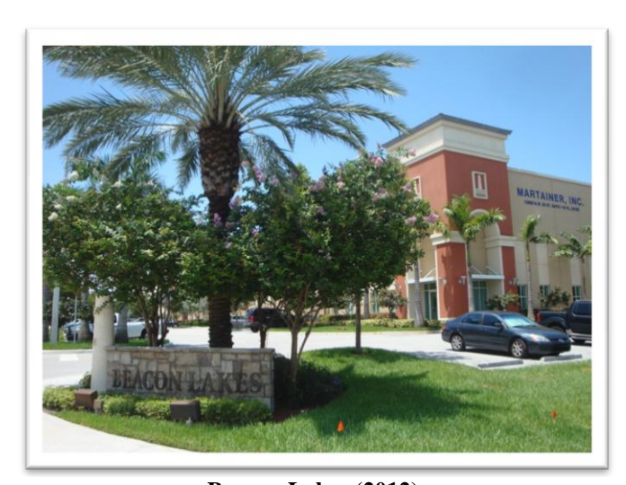
Beacon Lakes (2012)

On May 9, 2012, a Site Rehabilitation Completion Order was issued for the AMB Codina Beacon Lakes, LLC site, for which a BSRA (BF130301001) was executed on November 24, 2003. Located in the vicinity of NW 117<sup>th</sup> Avenue and NW 25<sup>th</sup> Street, the site was contaminated with Polycyclic Aromatic Hydrocarbons, Total Recoverable Petroleum Hydrocarbons and arsenic as a result of the former mixing of soil and horse manure at the site and the dumping of construction and demolition debris. Solid waste was removed and source removal was conducted. The redevelopment consists of a business park with warehouses, office buildings and retail space.