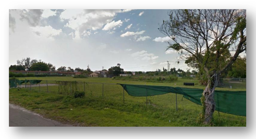
Vacant lot (2014)

On December 23, 2014, the City of North Miami entered into a BSRA (BF131403001) for a vacant property identified by Miami-Dade Folio number 06-2219-000-1620. The property was formerly occupied by the Rucks Park Wastewater Treatment Plant and contained a plant nursery. Current contaminants of concern include arsenic, ammonia and fecal coliform in the groundwater and arsenic, lead, pesticides and polycylic aromatic hydrocarbons in soil. Development proposals considered for the Rucks Park site include conservation, recreation, healthcare and/or residential uses.