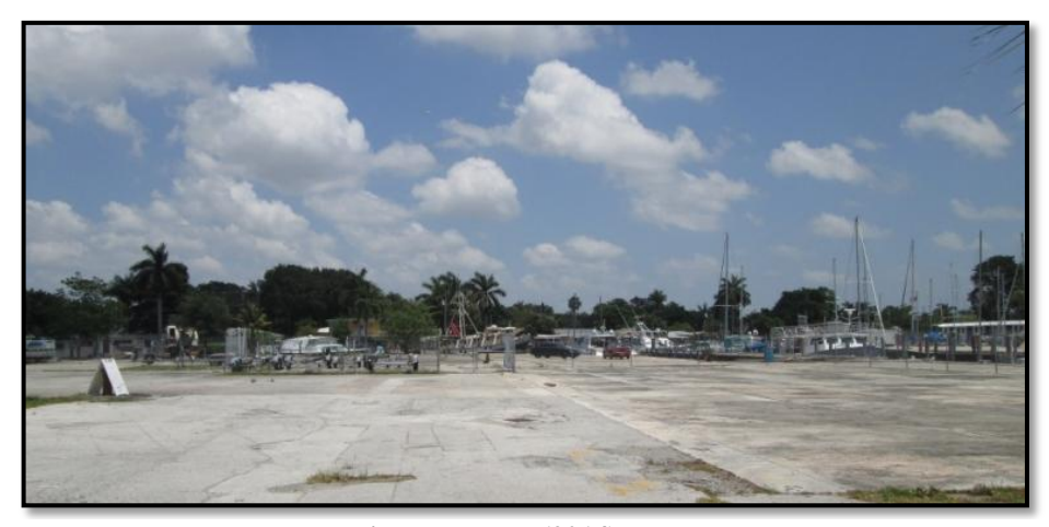
Inactive boat yard (2014)

On November 1, 2013, a BSRA was executed for the Miami River Marina, LLC site (BF130502001) located at 1975, 1995 and 2051 NW 11<sup>th</sup> Street and 1142 NW 21<sup>st</sup> Avenue. The 8.56 acre site is the former location of the Consolidated Yacht Corporation boat yard which built, repaired and renovated marine vessels and associated equipment. The contamination at the site consists of metals in soil and in limited areas of groundwater. Site assessment and groundwater monitoring activities are currently being completed in pursuit of a No Further Action with Conditions. Miami River Marina, LLC plans to redevelop the site as an active boatyard and/or facility which services the marine industry.