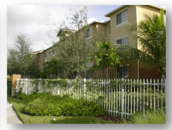
Corinthian Apartments (2010)