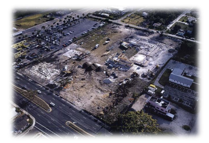
The Corinthian prior to site construction (April 13, 2006)

On December 20, 2004, a BSRA was executed with Liberty City Holdings, LLC (BF139904002) for the development of Corinthian Multifamily Apartments at 7725 NW 22 Avenue. The site formerly housed a plant nursery and contamination assessment documented arsenic soil and groundwater contamination. A conditional closure, with engineering and institutional controls, has been elected for the site. Construction of the apartment building was completed in July of 2007. The engineering control has been completed. Groundwater impacts at the property boundary have been documented and remedial action is pending.