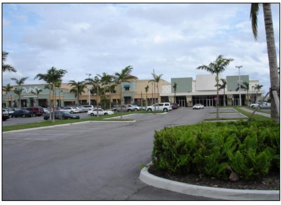
Completed Shopping Center