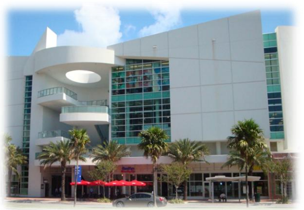
AR&J SOBE/Former Potamkin Properties

Executed: November 24, 2003 SRCO: May 9, 2012