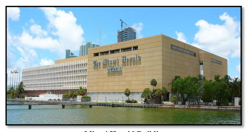
Miami Herald Building

A BSRA was executed for the Resorts World Miami Brownfield Site (BF139801006) in downtown Miami on December 31, 2012. The site includes a parcel which housed the fromer Miami Herald building at One Herald Plaza. Site assessment activities documented Arsenic, Barium and Polycyclic Aromatic Hydrocarbon soil contamination and Arsenic, Ammonia and Vinyl Chloride contamination of the groundwater. Monitoring of the groundwater is currently being conducted. Demolition of existing structures has been completed. The developer intends to redevelop the site as a major hotel, residential condominium and entertainment complex.