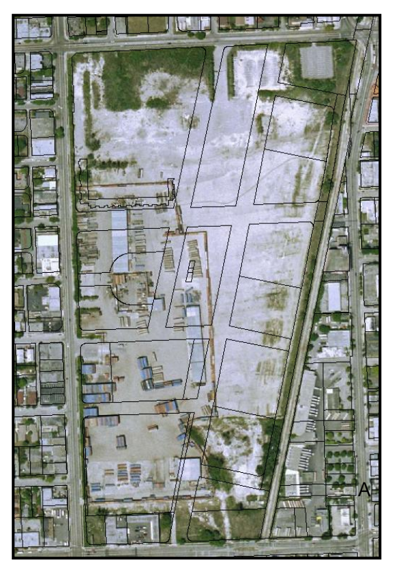
Midtown Miami prior to site development (2003)

A BSRA (BF139801002) was executed on December 24, 2003, with Biscayne Development Partners, LLC, for the Midtown Miami/former Buena Vista site located at 3111 N. Miami Avenue. The site was formerly owned by the Florida East Coast Railway and was used as a storage yard for freight containers in the maritime transport of goods. The contamination assessment documented lead and arsenic in the soil and arsenic and petroleum contamination in the groundwater. This site is currently in the institutional and engineering control plan phase in pursuit of a No Further Action with Conditions site closure. The development is mixed use and when completed will consist of 600,000 square feet of retail space, 3,000 condo lofts and 350 apartment units. It will have an estimated development value of $1.2 billion and will generate an estimated 1,700 permanent jobs. Construction has commenced on an additional two tracts for retail space (Wal-Mart) and residential space (multi-story apartments). The remaining tracts have interim engineering controls.