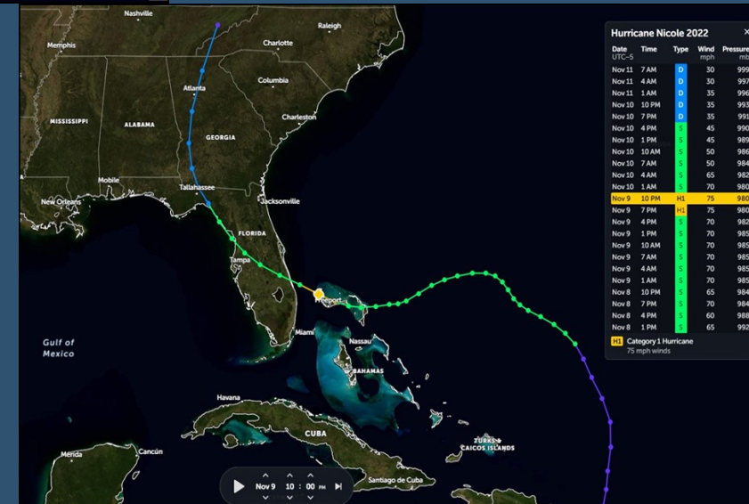
Hurricane Nicole track