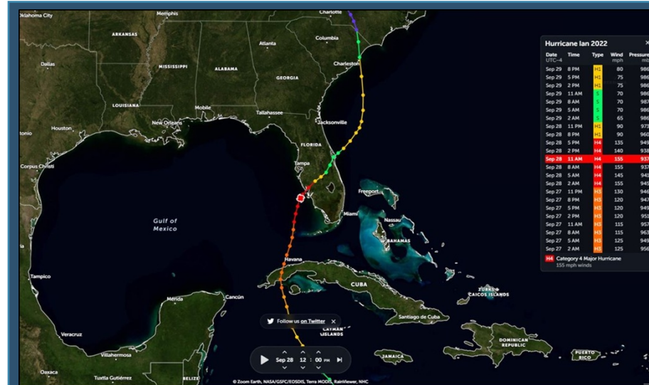
Hurricane Ian track