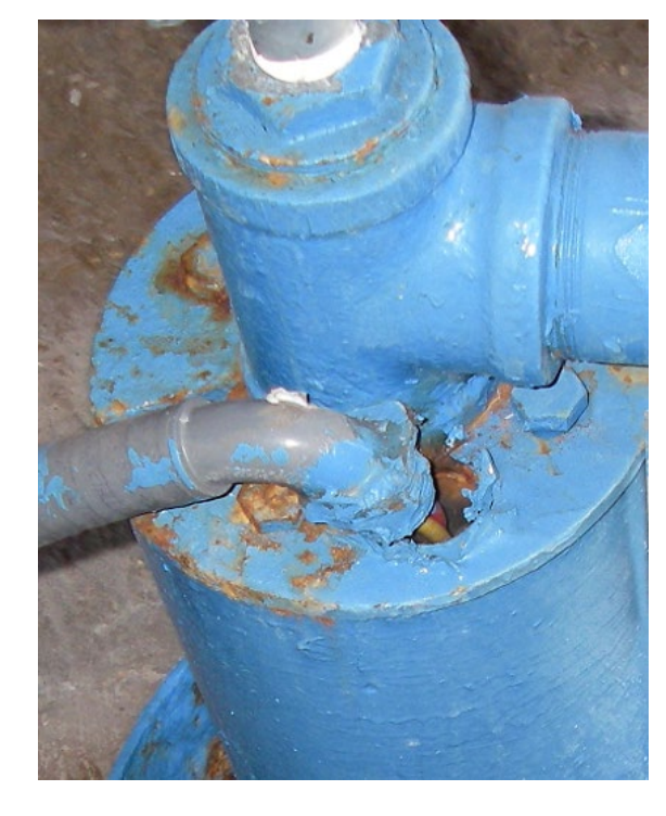
Opening in well seal