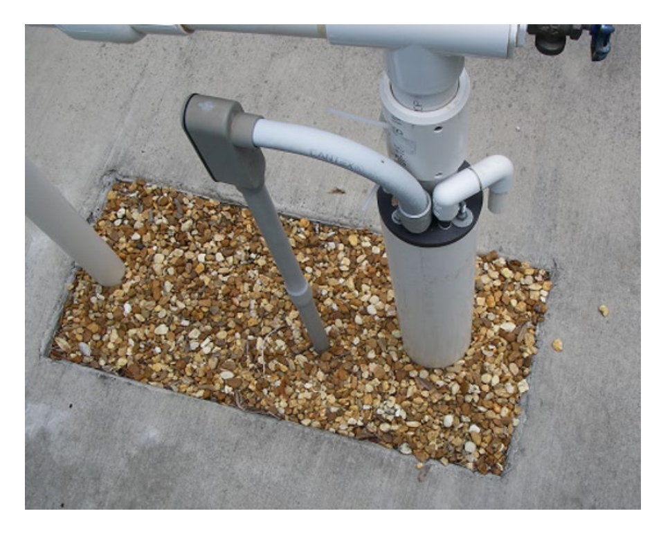
Improper well pad