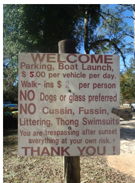
Adventures Perdido River