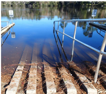
Perdido Boat Ramp, US 90, Liz Sparks

Adventures Perdido River , (850) 968-5529, 160 River Annex Rd., Cantonment, 32533.