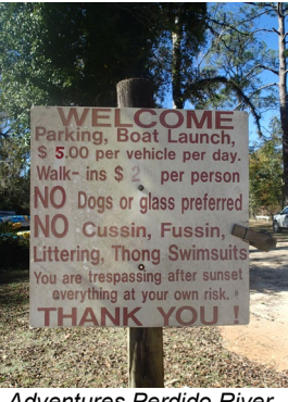
Adventures Perdido River