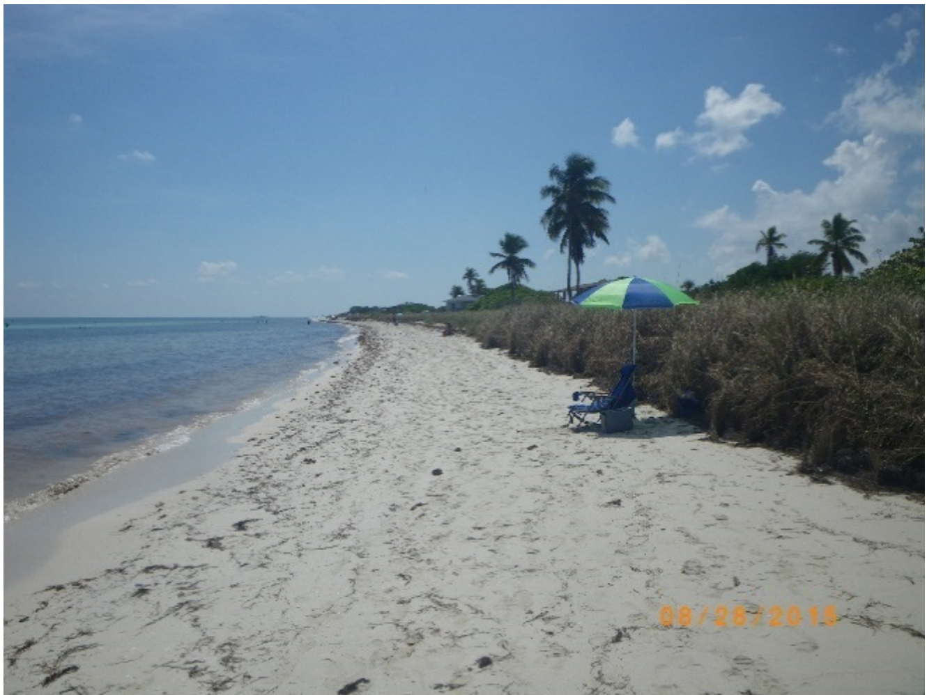
Sandspur Beach at Bahia Honda State Park in the Florida Keys. DEP South District photo, 2015.