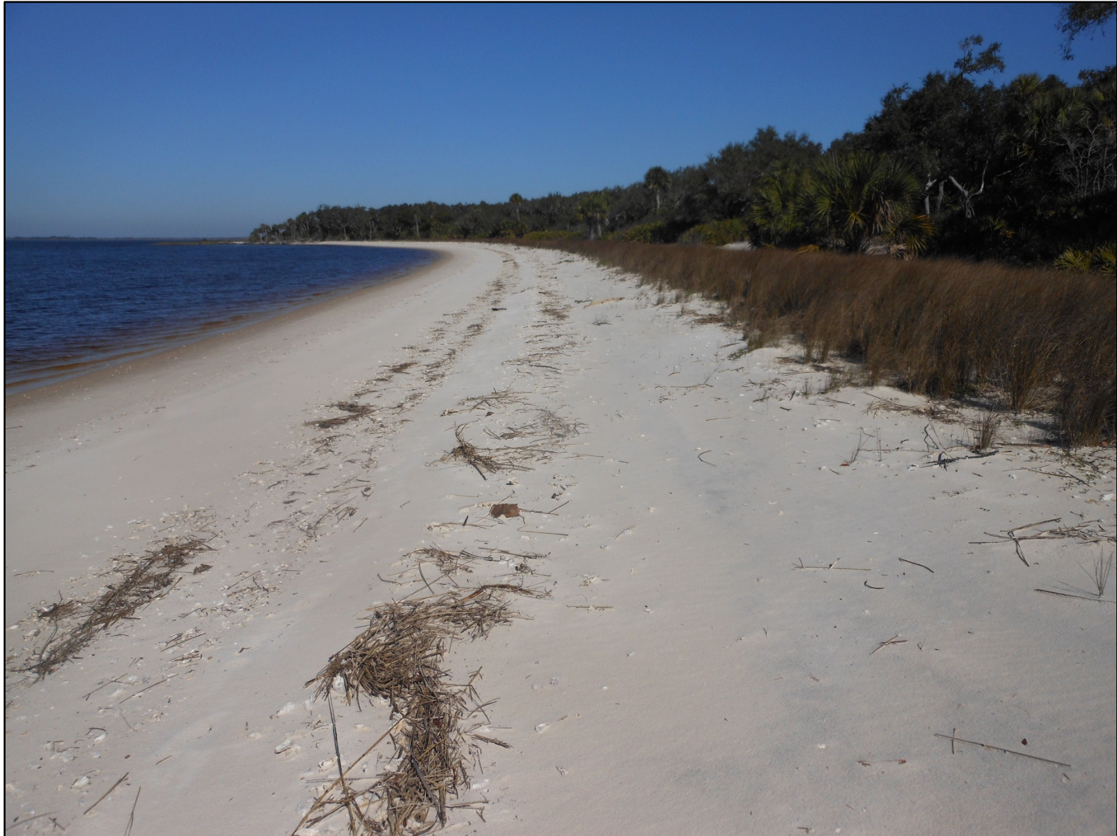
Deer Island offshore of Levy County, Florida. FDEP photo taken by Ralph Clark, February 2014.