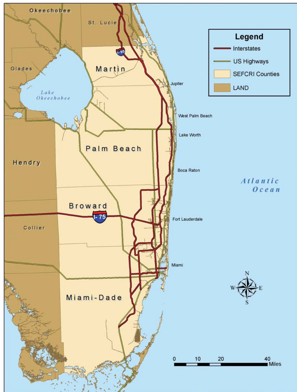
Figure 1. The Southeast Florida Coral Reef Initiative spans the coral communities, coastal waters and lands of Miami-Dade, Broward, Palm Beach and Martin Counties.