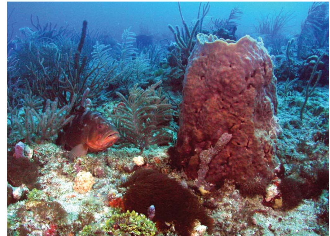
Figure 3. Large fishes, such as this grouper, once abundant on southeast Florida reefs, are rarely seen today.

Removal of living marine resources by recreational and commercial activities impacts the quality and quantity of marine populations and communities, and can threaten the long-term ecological persistence of reefs as we know them (Figure 3). Excessive use compromises the integrity, stability and beauty of the marine ecosystems by removal of organisms that result in degradation of the coral reef ecosystem. The consequences include: unsustainable fisheries with diminished yields of fishes and shellfishes; loss of opportunities for research and education; user conflicts; reduced recreational enjoyment; and diminished economic and social benefits through degraded ecosystem function.