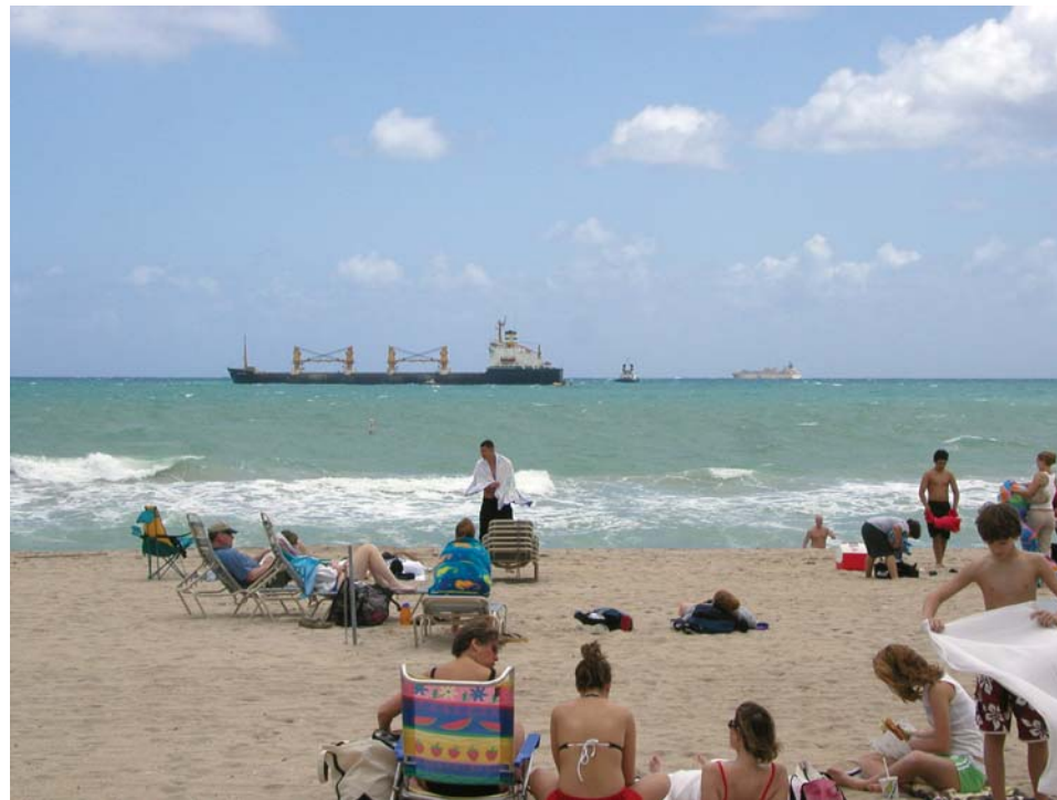
Figure 5. Large ships cross the reefs of southeast Florida to access ports-of-call and adjacent anchorages.

Coral systems in southeast Florida are threatened by projects and activities such as anchoring, vessel groundings (Figure 5), infrastructure installation (e.g. cables, pipelines and outfalls), beach renourishment, and dredge and fill operations in and around the reefs of southeast Florida.