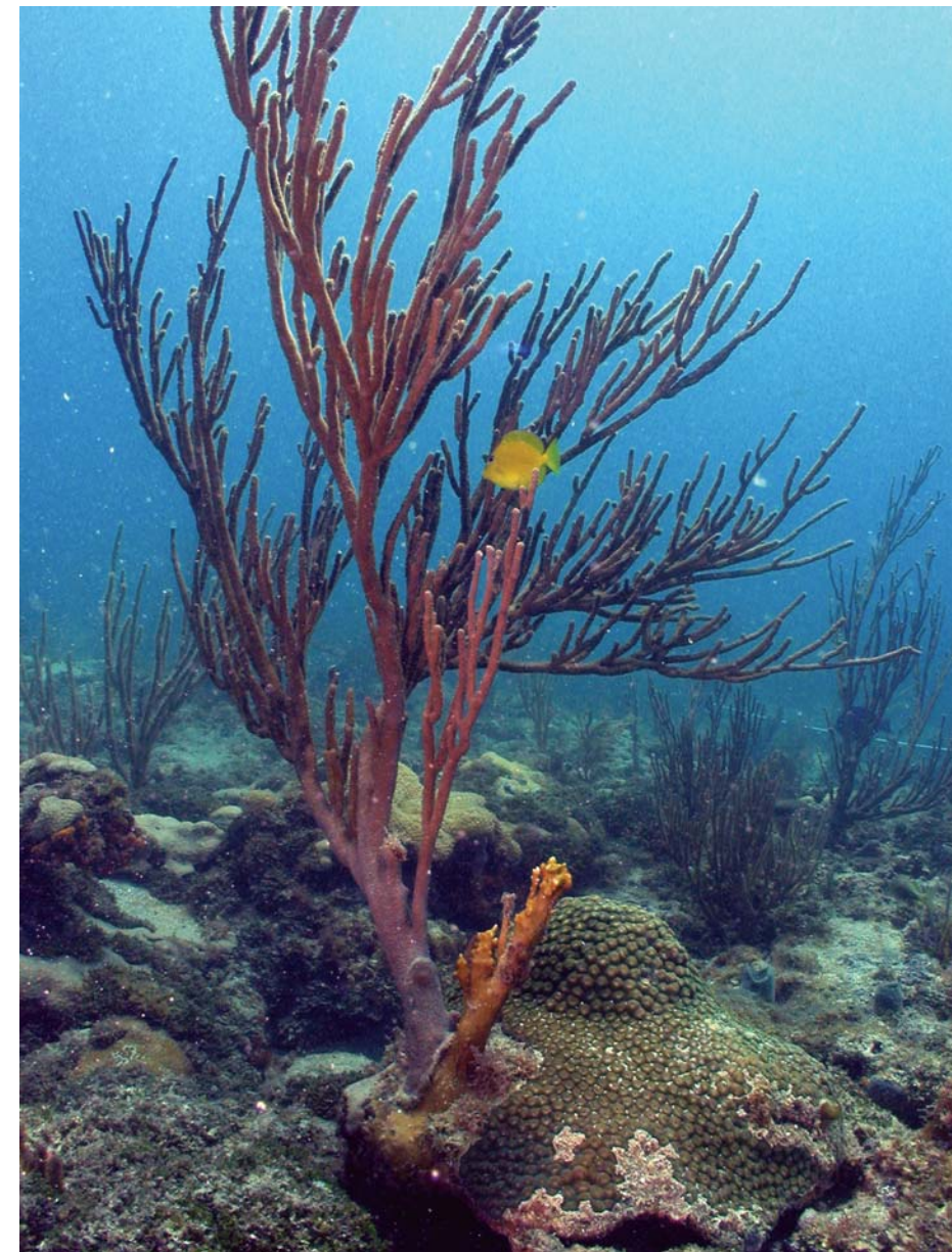
Figure 2. The southeast Florida coral reef ecosystem is the northern extension of the Florida reef tract. It is generally comprised of three reefs running parallel to shore and separated by sand flats. The reefs are colonized by a variety of organisms including stony corals, octocorals, sponges and algae, which provide habitat, food and shelter for many species of fishes, invertebrates, sea turtles and marine mammals.

Project 12: Offer media excursions about the southeast Florida coral reef ecosystem and the SEFCRI.