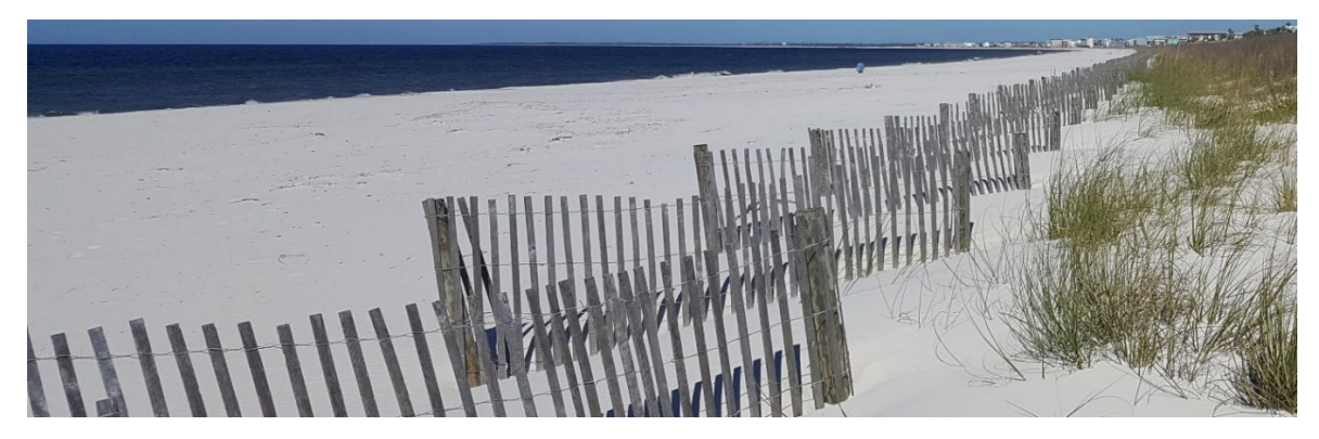
Figure 1: Sand fences installed to state of Florida specifications for the Mexico Beach dune restoration project built after Hurricane Michael. These sand collection fences have enlarged the new dune by trapping sand from the beach. Installation of sand fences in combination with planting vegetation has been a successful dune restoration method.

The state of Florida requires permits for sand fences and other coastal construction seaward of the coastal construction control line (CCCL) under section 161.053, Florida Statutes, of the Beach and Shore Preservation Act and the CCCL Rule Chapters 62B-33 and 62B-34, Florida Administrative Code.