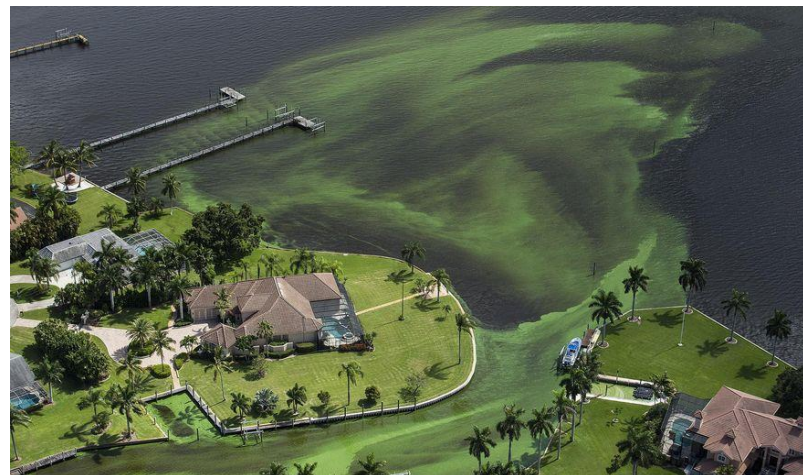
Harmful Algae Blooms