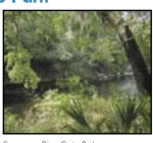
Suwannee River State Park

Suwannee River State Park, west of Live Oak off US 90, has a hiking trail for everyone. The Earthworks Trail leads through defensive earthworks built during the Civil War, and the Sandhills Trail passes through the cemetery of the ghost town of Columbus. The Suwannee River Trail System has several options to enjoy scenic views along the river and its cypress-lined tributary. Backpackers can head out on the Big Oak Trail, which passes a side trail to the historic ruins of a former governor's plantation before it connects