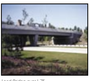
Land Bridge over 1-75

This mile-wide corridor across Central Florida was once meant to be a barge canal expediting shipping across the peninsula. Instead, it's been preserved for recreational enjoyment and wildlife habitat where a linear section of the Florida Trail south of Ocala traverses sandhills, pine flatwoods, and steep forested slopes created by the canal building project in the 1930s. The trail offers