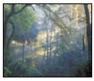
Ocala National Forest

First blazed in 1966, this segment of the Florida Trail is also its most popular, leading backpackers on a weeklong journey through the world's largest scrub habitat, from Clearwater Lake Recreation Area north of Eustis to the Buckman Lock south of Palatka. Several trailheads provide day hikers access to spectacular spots, including the Juniper Prairie Wilderness off SR 40 east of Ocala. A popular loop along the Florida Trail, the Yearling Trail,