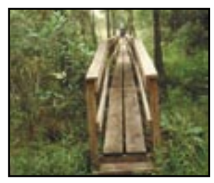
Little-Big Econ State Forest

Named one of the nation's top family-friendly trails by the American Hiking Society, a linear section of the Florida Trail along the Econlockhatchee River east of Orlando provides scenic views from the shade of palm hammocks on the bluffs high above this tributary of the St. Johns River, crossing numerous bridges over steep ravines. Trailheads are at Barr Street (SR 426) in Oviedo and Snowhill Road in Chuluota.