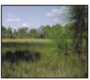
-akahatchee Strand Preserve State Park

Along the Tamiami Trail east of Naples, the Big Cypress Bend Boardwalk* introduces you to some of the most ancient cypresses you'll ever see, where American bald eagles nest in their canopy above the Fakahatchee Strand. The boardwalk ends at a broad pond within the strand and you must backtrack to the trailhead. Renowned for its diversity of bromeliads and orchids. Fakahatchee Strand Preserve State Park also offers walks on old tramways* leading from Janes Scenic Drive, with guided hikes during the peak of orchid blooms each summer.