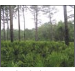
Wekiwa Springs State Park

Surrounding one of Florida's beautiful first magnitude springs just north of Orlando, the hiking trails of Wekiwa Springs State Park offer options for everyone. The gentle Wet to Dry Trail boardwalk slips through the river swamp along the spring to meet the Wekiwa Springs Hiking Trail in the sandhills. The linear White Trail leads to the main wilderness loop where a backpacker's campsite, Camp Cozy, nestles under the cabbage palms along Rock Springs Run.