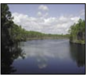
New River in Tate's Hell State Forest

Where the Gulf breezes whisper through the tall pines along the shoreline between Carrabelle and Apalachicola, Tate's Hell State Forest provides an introduction to the coastal pine forests that front the Gulf of Mexico. High Bluffs Coastal Nature Trail loops through dunes covered with scrub plants like Florida rosemary and scrub mint under a canopy of sand pines, and passes within sight of cypress domes. Access the trailhead from US 98 just west of Carrabelle Beach.