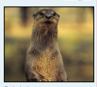
On the Lookout

This river gently curves through Twin Rivers State Forest past hardwood forests, crystal-clear springs, and sandbars along the bends. Primitive camping is allowed on Twin Rivers State Forest lands along the river without a permit. Primitive campsites can be found at three sites along the river with yellow blazes on trees visible from the river. There are some small shoals not generally