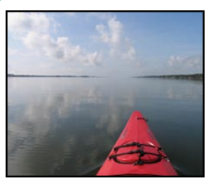
Serenity on Indian River Lagoon

The Indian River Lagoon extends 156 miles along Florida's East Coast from Ponce de Leon Inlet to Jupiter Inlet and is considered to be North America's most diverse estuary. Overlapping boundaries of tropical and subtropical climates have helped to create a system that supports 4,300 plants and animals, 72 of which are endangered or threatened. Nearly 1/3 of the nation's manatees live here or migrate through