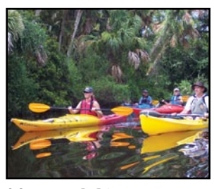
A Getaway on St. Sebastian

Located along Florida's East Coast near Vero Beach, the meandering St. Sebastian River starts out narrow with overhanging branches before it opens up into a sunny, peaceful river. Resident manatees are sometimes spotted eating from submerged branches. The beginning of this trip is very winding and there are some branches to navigate around, over or under but once the river widens, it is an easy paddle. Wildlife such