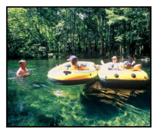
Relaxing on the Ichetucknee

Located four miles northwest of Fort White, off of State Roads 47 and 238, the pristine Ichetucknee River flows for six miles through shaded hammocks and wetlands before it joins the Santa Fe River. Since the river is spring fed, it is crystal clear and always 72 degrees. In 1972, the headspring of the river was declared a National Natural Landmark by the U.S. Department of the Interior. From the end of May until early September,