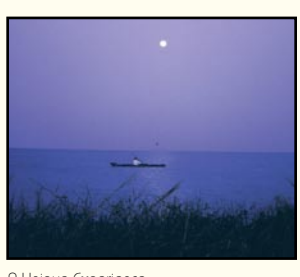
A Unique Experience

In some places in the ocean and estuaries, bioluminescent particles are so abundant that any disturbance such as a boat, a fish, or even a hand passing through the water can produce a shimmering light show. In bioluminescence, electrons are excited by a very efficient chemical reaction that generates no heat at all. Bioluminescent creatures are beautiful, fascinating, and critical to