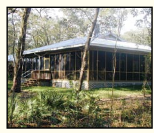
A Cabin on the Suwannee

Each hub provides opportunity for daytime activities and overnight accommodations in cabins, camping areas or private sector lodgings. Seven river camps at points located between the hubs support multi-day river, hiking, bicycling and riding tours.