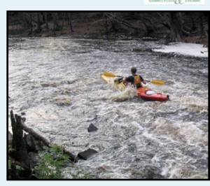
Riding the Aucilla

oaks, cypress and other trees, the Aucilla is as picturesque as it is wild. The river runs 75 miles to the Gulf of Mexico, but only 25 miles is navigable starting near Lamont. Wildlife commonly seen in the area includes river otter, hawks and a variety of wading birds. This river has rapids and shoals that paddlers can find challenging, especially at low water. Paddling difficulty is moderate to strenuous and is not recommended for beginners.