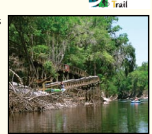
Suwannee River Wilderness Trail

For those who believe "the journey is the destination," the Suwannee River provides a scenic route past springs, limestone outcrops and sandy banks. The Suwannee River Wilderness Trail (SRWT) runs 207 miles from the river's headwaters in rural north Florida to the Gulf of Mexico.