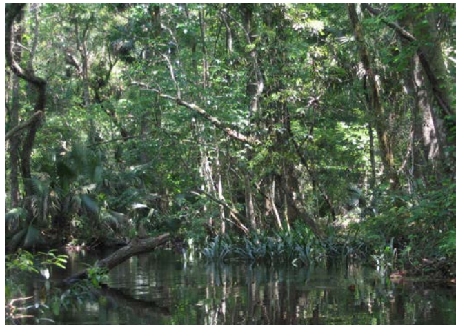
Slave Canal, FWC