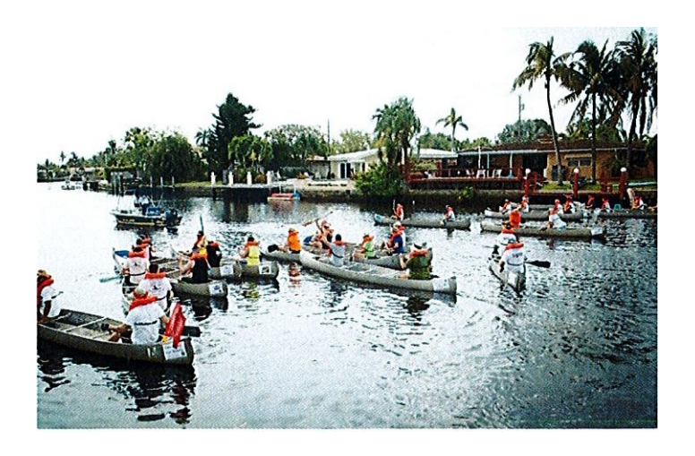
Access Point 2: