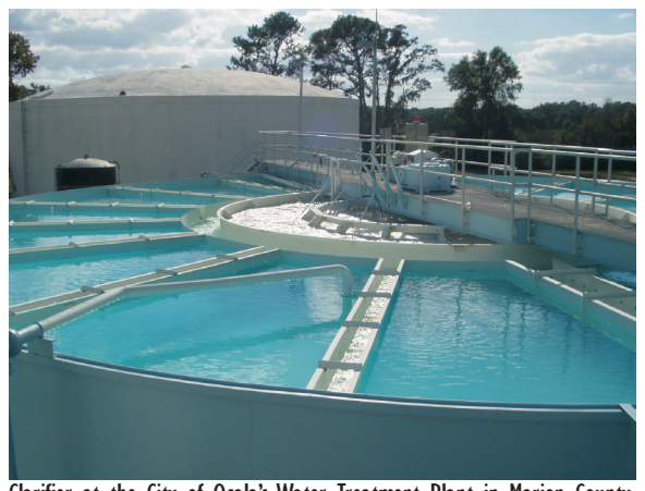
Clarifier at the City of Ocala's Water Treatment Plant in Marion County. This clarifier combines mixing, coagulation, flocculation, sedimentation, and softening in a single tank.

Disinfection is employed to kill microbes in the water. A residual chemical disinfectant ensures that they will not reemerge in the water as it moves through the distribution system.