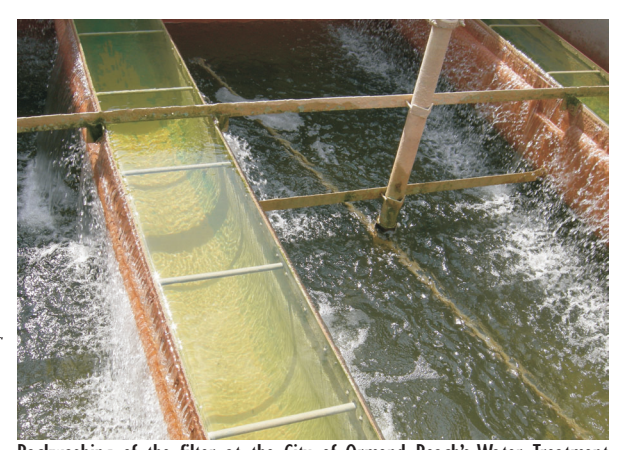
Backwashing of the filter at the City of Ormond Beach's Water Treatment Plant in Volusia County. During backwashing, water is pumped back through the filter from the bottom to the top, expanding the filter and unclogging the pore spaces between the filter particles. After backwashing, the filter material settles back into position based on the relative density of the filter media (e.g., sand, anthracite, activated carbon).

Larger particles and flocs are allowed to settle under the influence of gravity. Large, dense flocs ensnare and trap smaller compounds on the way to the bottom of the clarifier or sedimentation basin providing additional treatment.