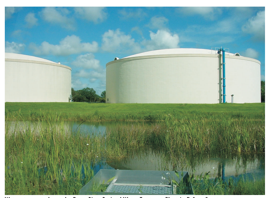
Water storage tanks at the Peace River Regional Water Treatment Plant in DeSoto County.

Under DEP's rules, if a cross-connection is discovered or there exists significant opportunity for a cross-connection to exist, either a backflow prevention device must be installed or service must be discontinued to that site. Water suppliers usually do not have the authority or capability to repeatedly inspect every consumer's premises for cross-connections and backflow protection. Instead, they protect the water supply by requiring that a proper backflow prevention device is installed and maintained at the water service connection to each site that poses a significant hazard to their water system. In addition to state law, local jurisdictions typically have provisions addressing cross-connection and backflow.