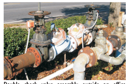
Double check valve assembly outside an office complex in Tallahassee, Leon County.

Through regulation and public education, the Drinking Water Program is addressing the health threat posed by cross-connection and backflow. While water generally only moves in one direction through the water