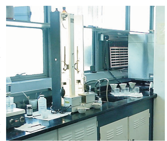
Laboratory at U.S. Sugar Corporation's Water Treatment Plant in Hendry County.

DEP's Drinking Water Program ensures that customers receive high quality drinking water by requiring public water systems to deliver water that is neither a health risk nor aesthetically objectionable due to taste, odor, or color. The water from rivers, lakes, and underground aquifers that ultimately becomes our drinking water may contain a number of Hendry County.