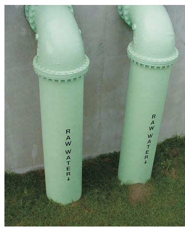
Influent lines at the Peace River Regional Water Treatment Plant in DeSoto County.

Contaminants originate from a wide variety of sources—farming, mining activities, gas stations, septic systems, leaky underground storage tanks, suburban lawns, wildlife, and many other sources. Contaminants seep into ground or surface water in storm water runoff and domestic and industrial wastewater discharges. Some contaminants, like inorganic and radioactive compounds, can also occur naturally in the soil and rocks with which water comes in contact.