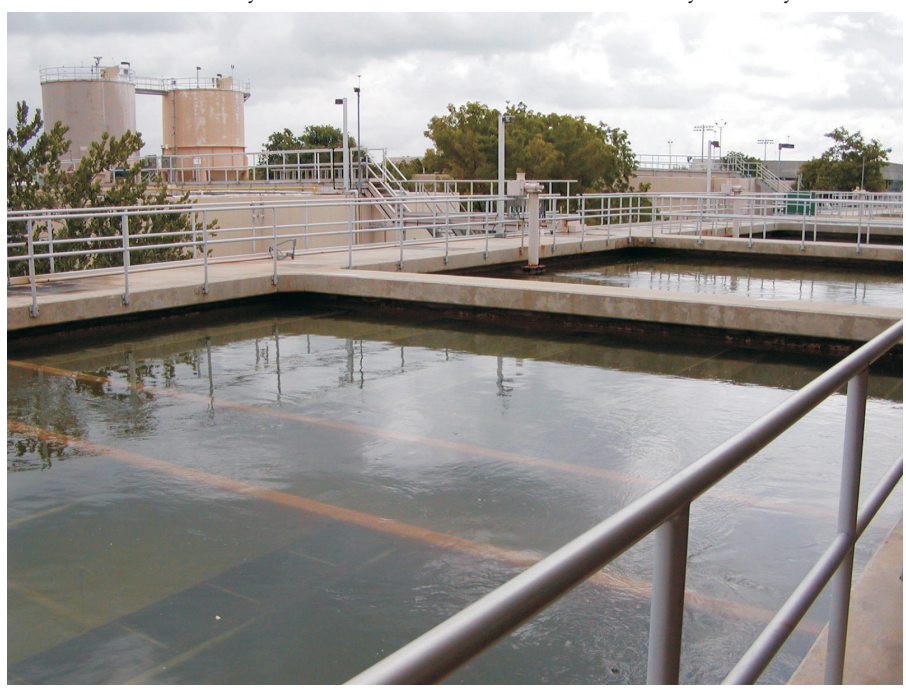
Filter at the City of Boca Raton's Water Treatment Plant in Palm Beach County.