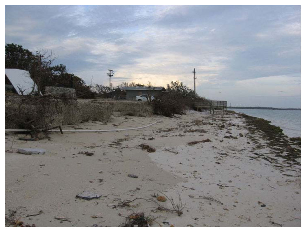
Photo 30. Severe erosion at Loggerhead Beach, Bahia Honda State Park.