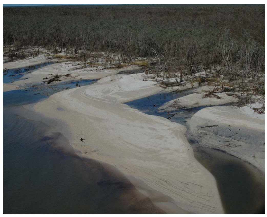
Photo 41. Storm surge scour channels between Shark River and Pavilion Key.