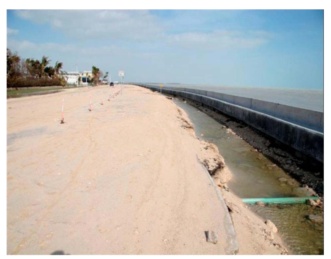
Photo 34. Scour behind seawall along South Roosevelt Boulevard.

South Roosevelt Boulevard – The eastern three-quarters of a mile of seawalled shoreline fronting U.S. Highway A1A was overtopped by the storm tide and waves of Wilma. Significant scour was sustained landward of the seawall (Photo 34).