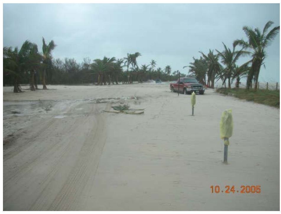
Photo 36. Overwash from Smathers Beach onto South Roosevelt Boulevard