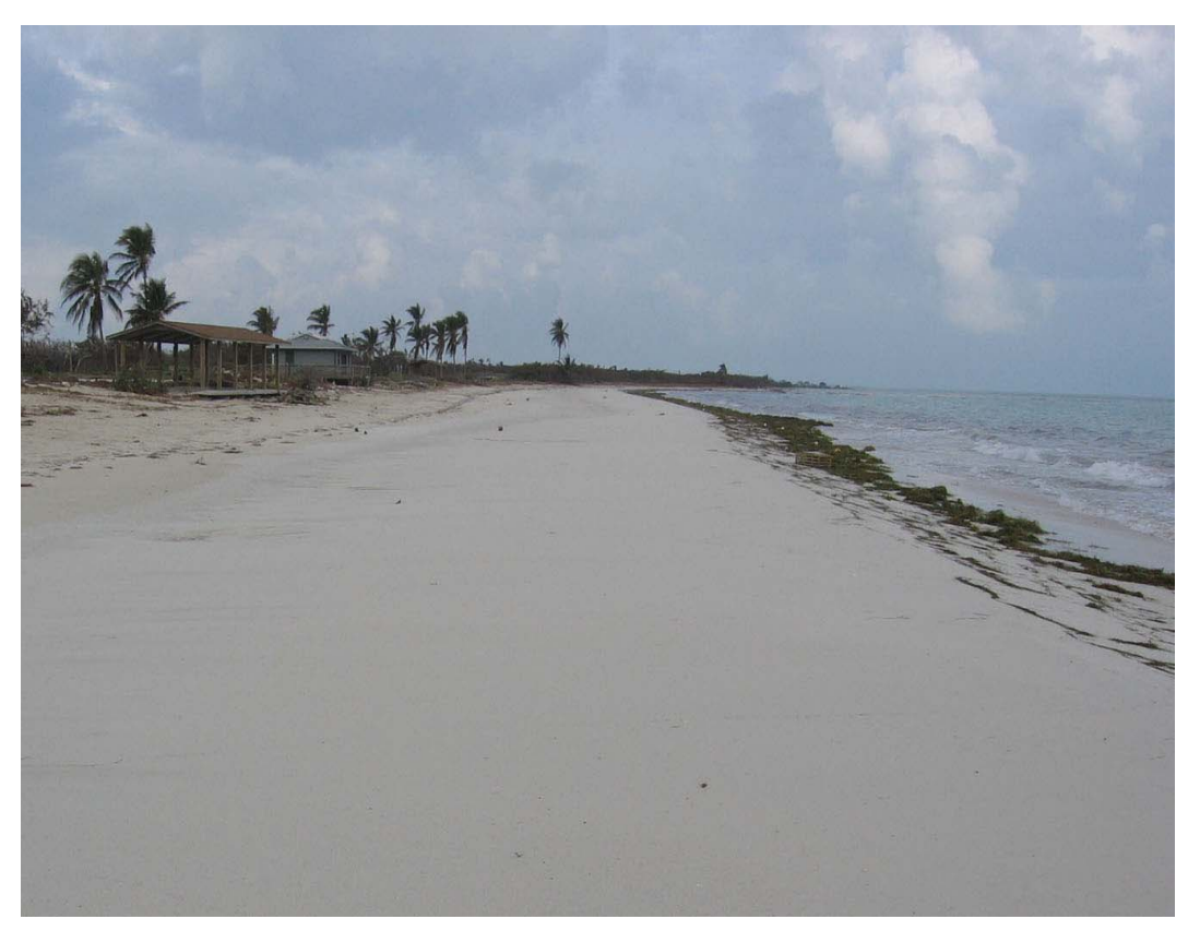
Photo 32. Substantial beach accretion at Sandspur Beach, Bahia Honda State Park.

Sandspur Beach – As occurred during Hurricane Rita in September 2005, minor dune erosion (condition II) was sustained along Sandspur Beach; however, there was substantial accretion of the beach during the passage of Hurricane Wilma. Historically and prior to the 2005 hurricane season, the beach width at Sandspur Beach was roughly 50 feet (Clark, 1990). After Wilma, the beach width exceeds 100 feet (Photo 32). In contrast, on the east end of the island, condition IV erosion was sustained due to scour by the storm surge being conveyed through the Ohio Bahia Honda Channel.