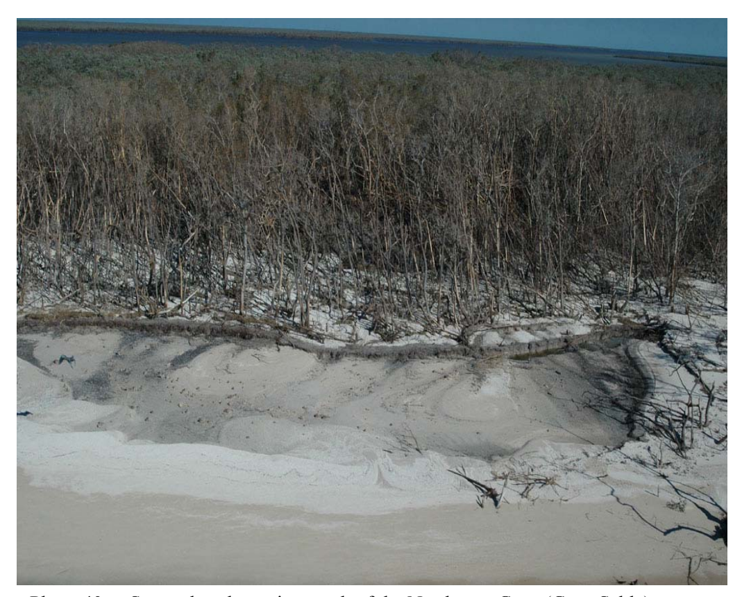
Photo 40. Severe beach erosion north of the Northwest Cape (Cape Sable).

The maximum wind field and highest storm surge of Hurricane Wilma devastated the 12.2 miles of carbonate sand and shell beaches of Cape Sable. Severe beach and dune erosion (condition IV) was sustained throughout this undeveloped region on the mainland gulf coast of Monroe County (Photo 40). Along segments where important sea turtle nesting habitat has been lost, the beaches have become critically eroded.