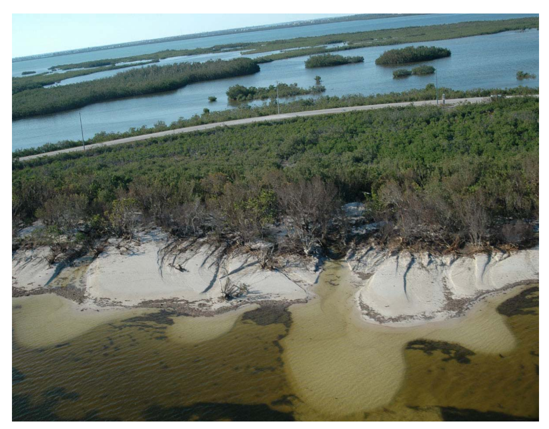
Photo 33. Storm surge discharge channels, Long Beach, Big Pine Key.

Key (Photo 33). Moderate to major beach and dune erosion (condition III-IV) was also sustained along the Newfound Harbor Keys.