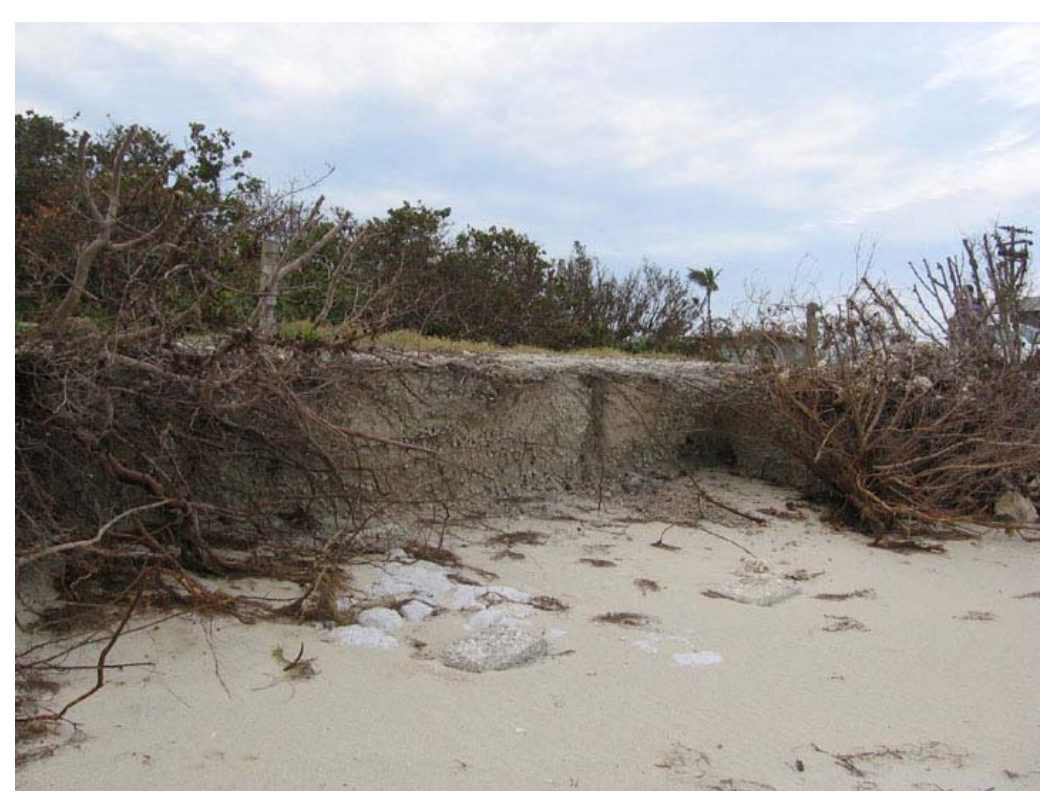
Photo 31. Eroded bluff at Loggerhead Beach, Bahia Honda State Park.