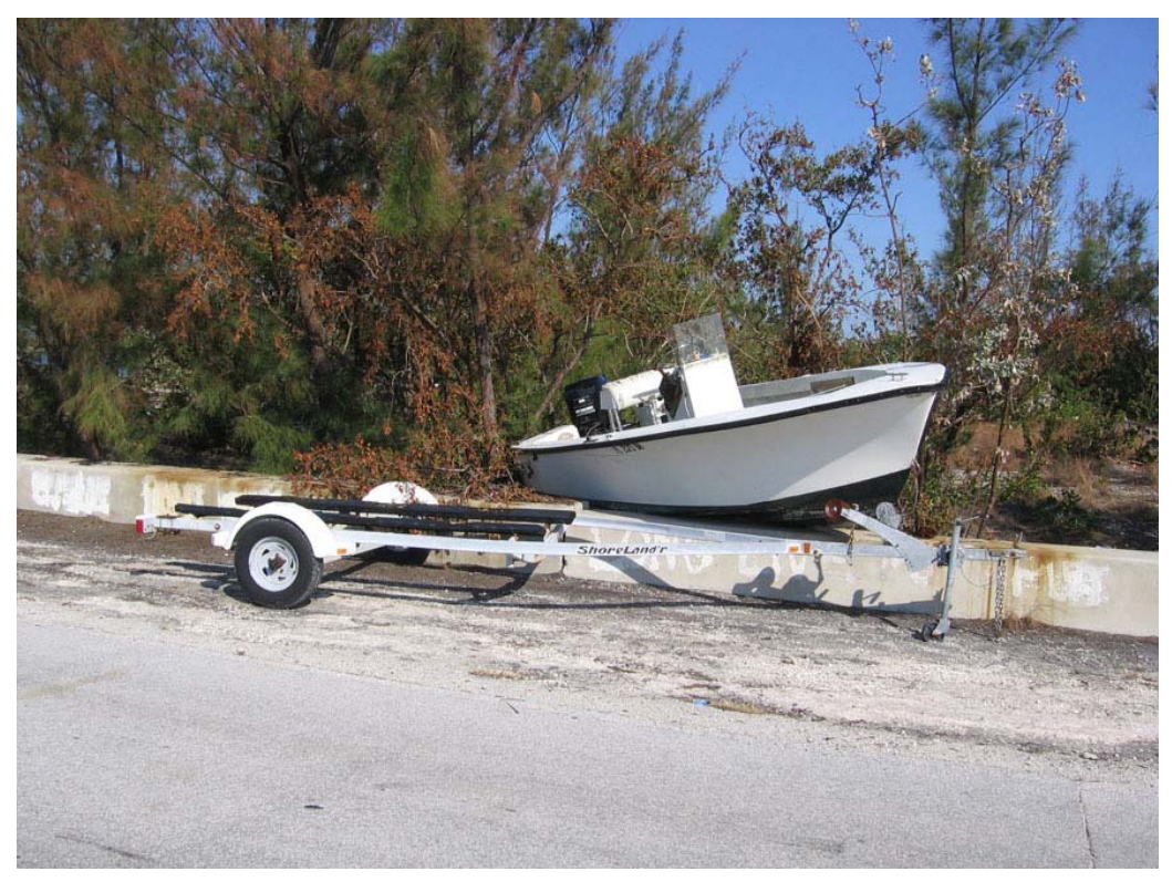
Photo 48. Trailered boat damaged by Wilma's storm surge on Stock Island.