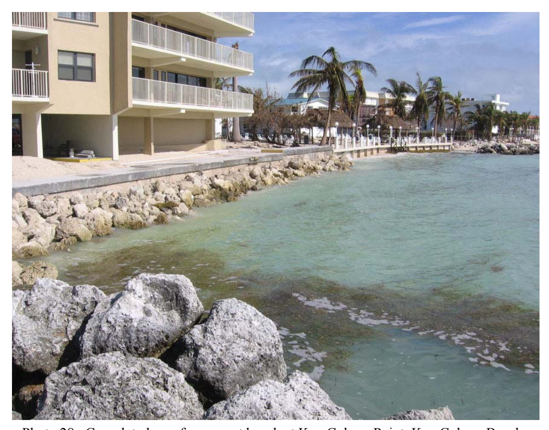
Photo 28. Complete loss of emergent beach at Key Colony Point, Key Colony Beach.

Along the private beaches east of Sandy Point, minor to moderate beach and dune erosion (condition II-III) was sustained. These beaches are within a groin field, and the cumulative erosion conditions since Hurricanes George (1998) and Irene (1999) have severely reduced their recreational and storm protective values. The segment of beach at the Key Colony Point Condominiums has been totally lost seaward of the seawall that fronts the development (Photo 28).