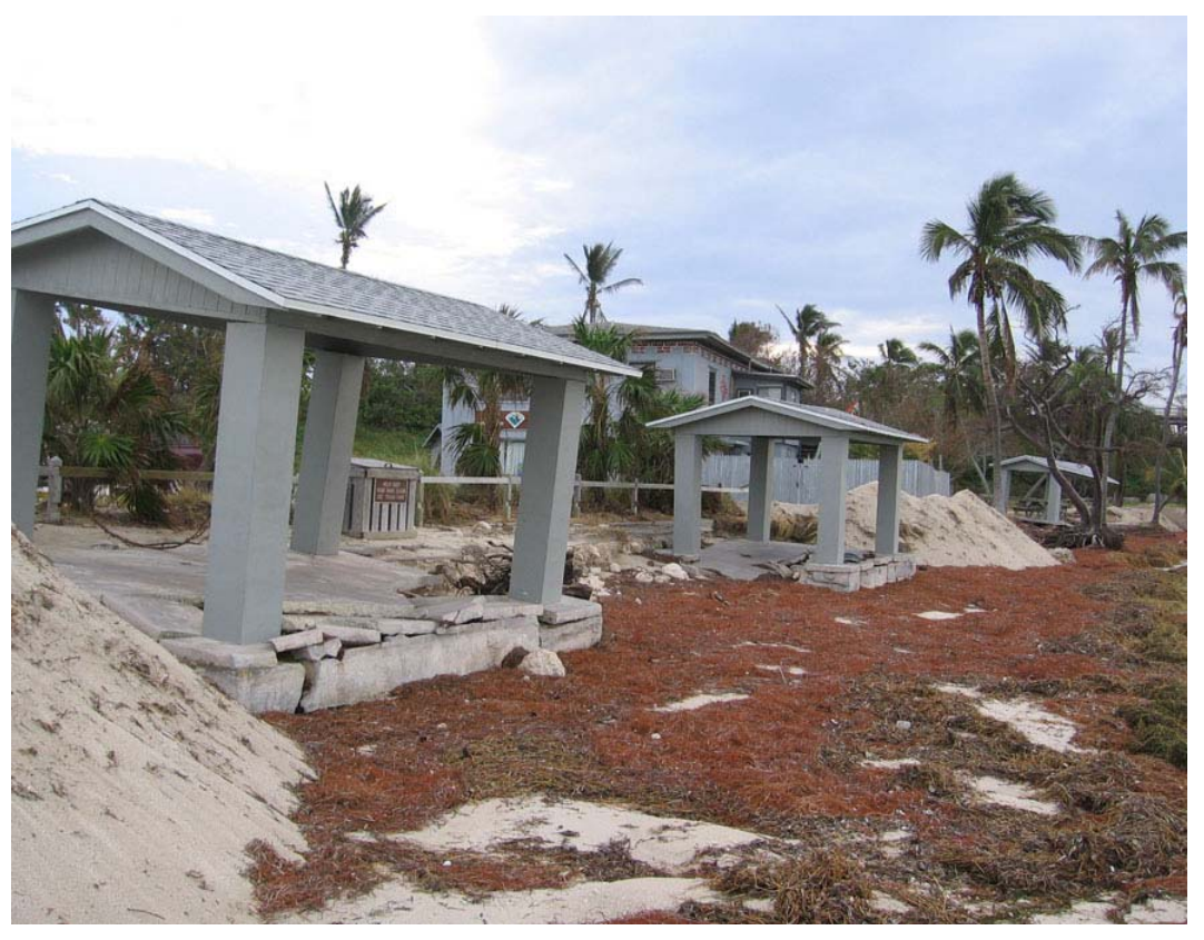
Photo 46. Destroyed picnic shelters, Calusa Beach, Bahia Honda State Park.

Loggerhead Beach – The park's west end beach fronting the Straits of Florida was severely impacted by the surge and waves of Wilma (see Photos 23 and 24). A 300-foot long service road west of the public bathhouse was destroyed by the erosion, and a beach access walkway was also destroyed. A section of the paved parking lot was also damaged.