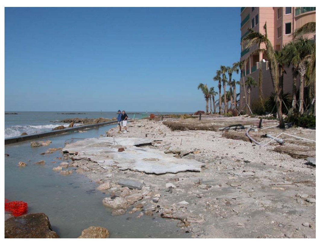
Photo 19. Seawall and revetment overtopped and damaged, south end of Marco Island.