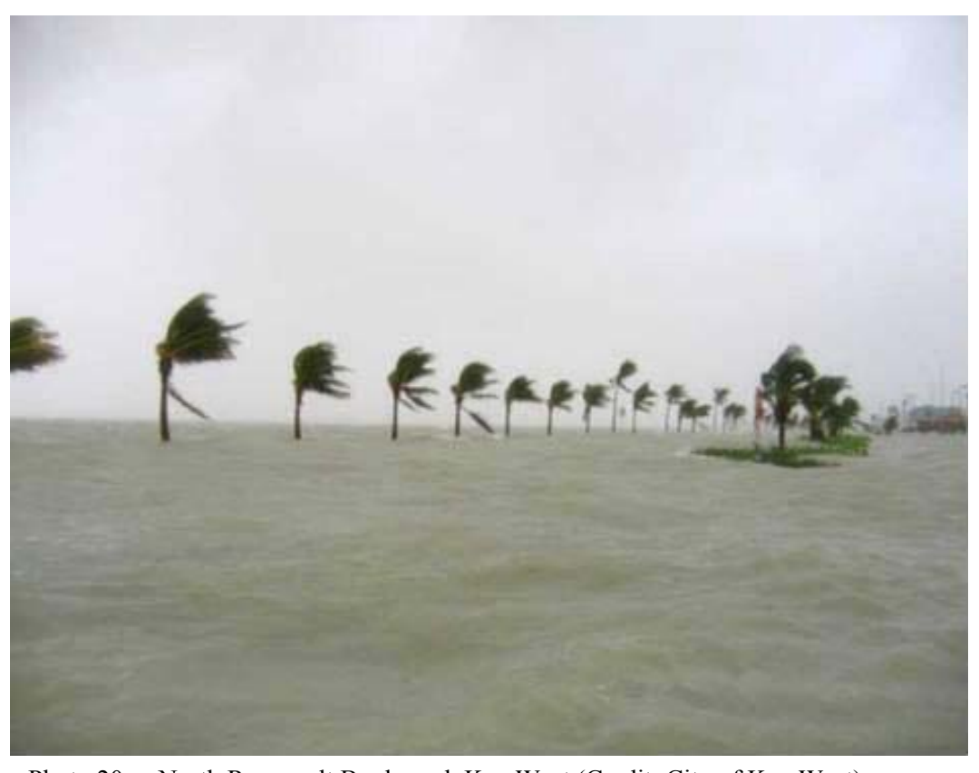
Photo 20. North Roosevelt Boulevard, Key West (Credit: City of Key West).

On Key Largo, the man-made beaches at Ocean Reef Club and John Pennekamp State Park sustained no apparent erosion. The man-made beaches of Tavernier and the private beaches of Plantation Key and Windley Key sustained no apparent erosion.