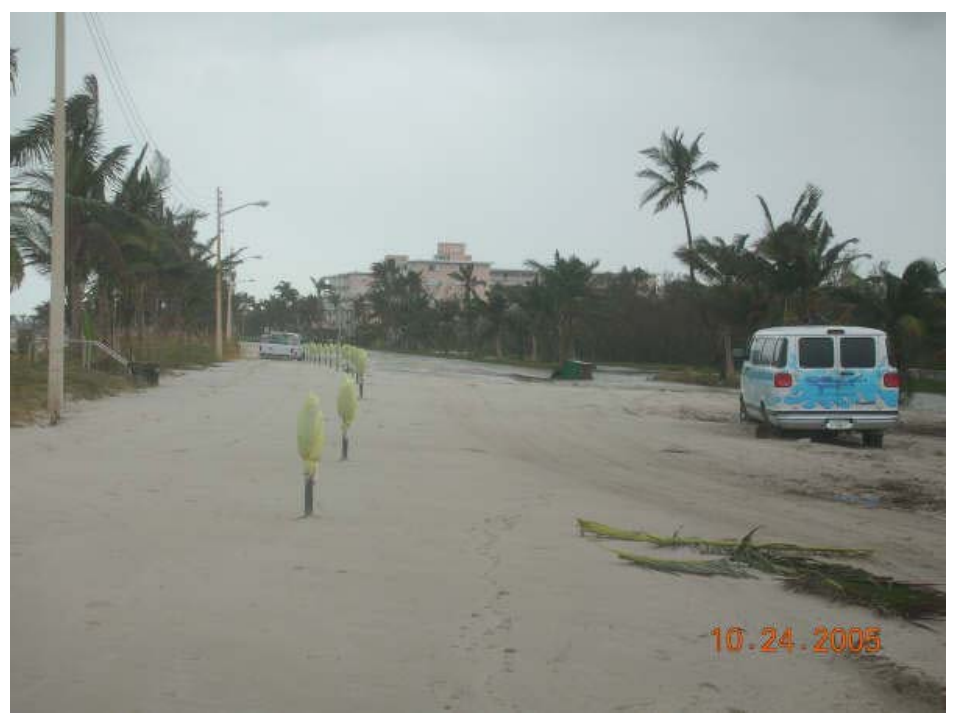
Photo 35. Overwash from Smathers Beach onto South Roosevelt Boulevard