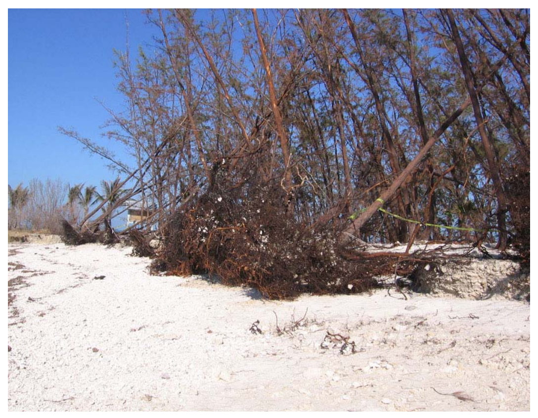
Photo 39. Severe dune erosion, Fort Zachary Taylor Historic State Park.