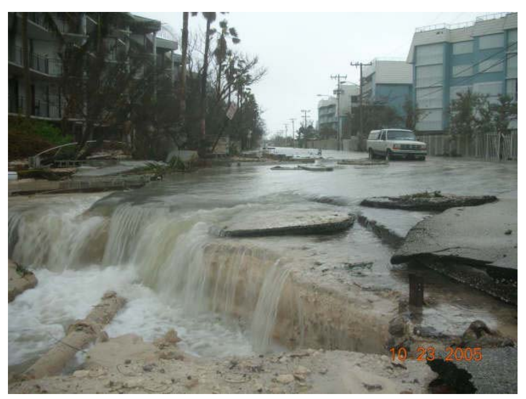
Photo 55. Bertha Street during Wilma's falling storm surge.